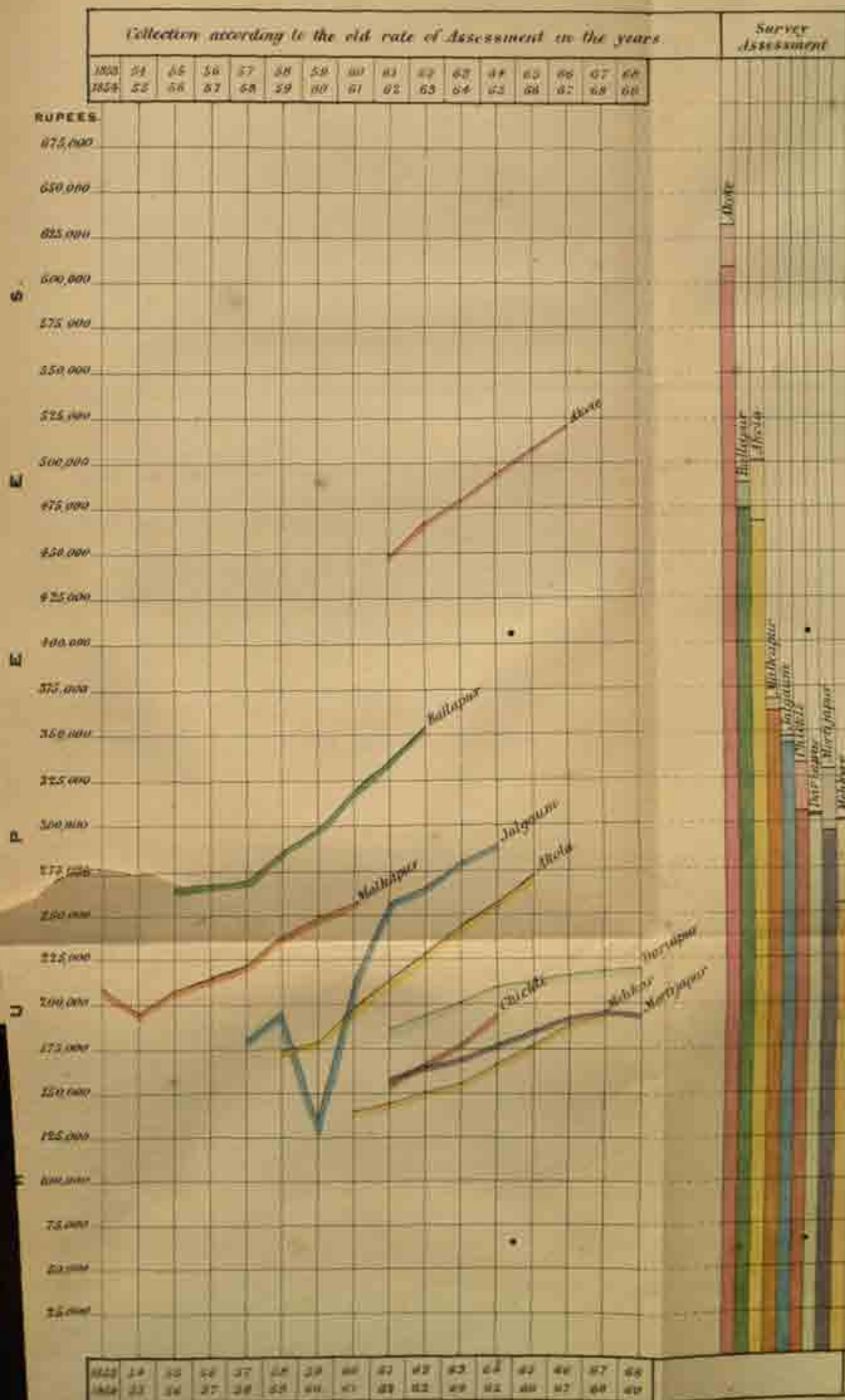
DIAGRAM illustrative of the fluctuations in the former collections of Revenue of the Government Arable Land in the 9 Talukas— Malkapur, Bilapur, Jalgaon, Chikli, Akola, Akot, Mekkar, Dargapur, and Martapur , during the years shown in the diagram.