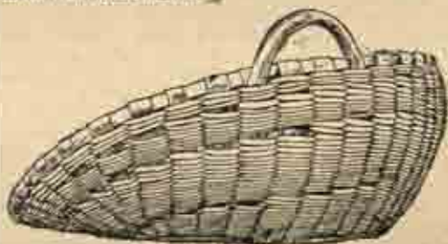
FIG. 1. Fan from France.

(2) It is the second form of winnower, the winnowing-basket, that is of cardinal importance in ancient ritual and mysticism, and this for a reason that will appear immediately. Much confusion has been caused by the fact that our word 'fan' has been used indiscriminately to translate alike the Latin ventilabrum and vannus , and the Greek κλῆρος , ἀντηλαγός , κλῆρος , and κλῆρος . The confusion is now inevitable, since the beautiful word 'fan' has passed into English literature as the rendering of two quite distinct implements, which have only this in common, that they are both used for cleaning corn. The use of the winnowing-spade or fork ( ventilabrum , κλῆρος [post. ἀντηλαγός ], κλῆρος ) has been already explained; the vannus , κλῆρος , and winnowing-basket, or corb, of modern times remains.