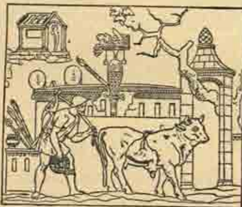
FIG. 3. Hellenistic relief: liknon holding firstfruits.

In a Hellenistic relief (fig. 3), now in Munich (Glyptothek, no. 601; T. Schreiber, Hellen. Reliefbilder , Leipzig, 1899, Taf. 80a), we see such a service: a little circular shrine, past which a peasant is going to market; in the middle of the shrine an ornamental pillar surmounted by the shovel-shaped wicker-basket from which hang bells to scare away evil influences; in the basket are fruits, leaves, and the phallos , the sign of fertility. Servius is confirmed by this and many other monuments.