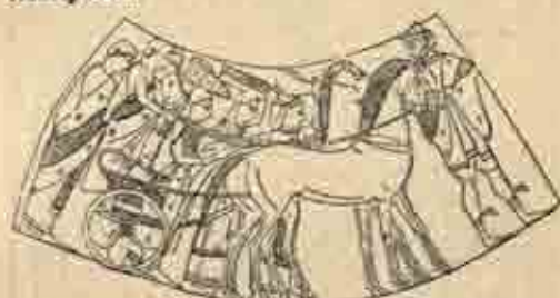
FIG. 6. Cinerary urn: Liknon in marriage procession.

first and third, carry winnow-corbs on their heads. One of the figures stands close to the veiled bride. A handle and the wicker-work of the corb are very clearly seen.