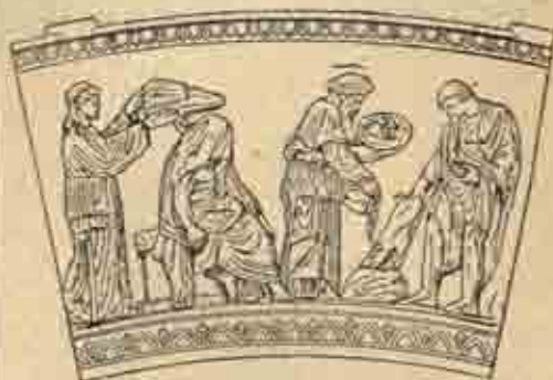
FIG. 7. Cinerary urn: Liknon at Eleusinian Mysteries.

liknon . Duly purified and fertilized, he will be able to pronounce the words, 'Bad have I fled, better have I found.'