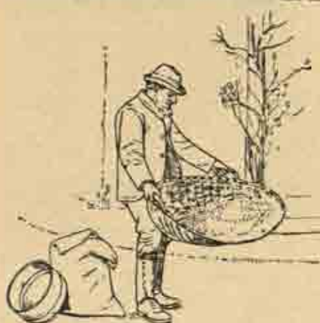
FIG. 2. Fan in use.

is in a sense ventilated, the wind plays no part in the process. By a particular knack of jerking and working the basket—a knack difficult to acquire and almost impossible to describe—the chaff is gradually propelled forward and out of the basket