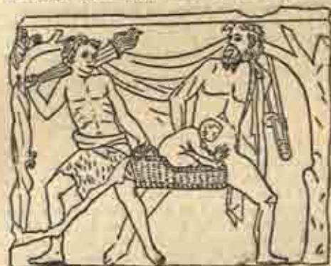
FIG. 5. Black-figured vase: Dionysus Liknites.

taken the place of more primitive offerings; but the symbolism, or rather magic, is the same. At a marriage every precaution is taken to suggest and induce fertility. On a black-figured vase now in the British Museum (Cat. B. 174) we see (fig. 5) a marriage procession. Two of the figures, the