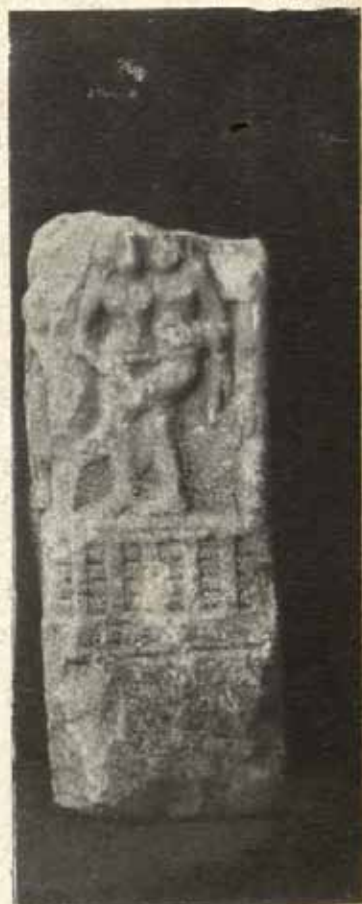
No. 3421—(b) Corner railing pillar, showing a male figure on a lap of a lady.