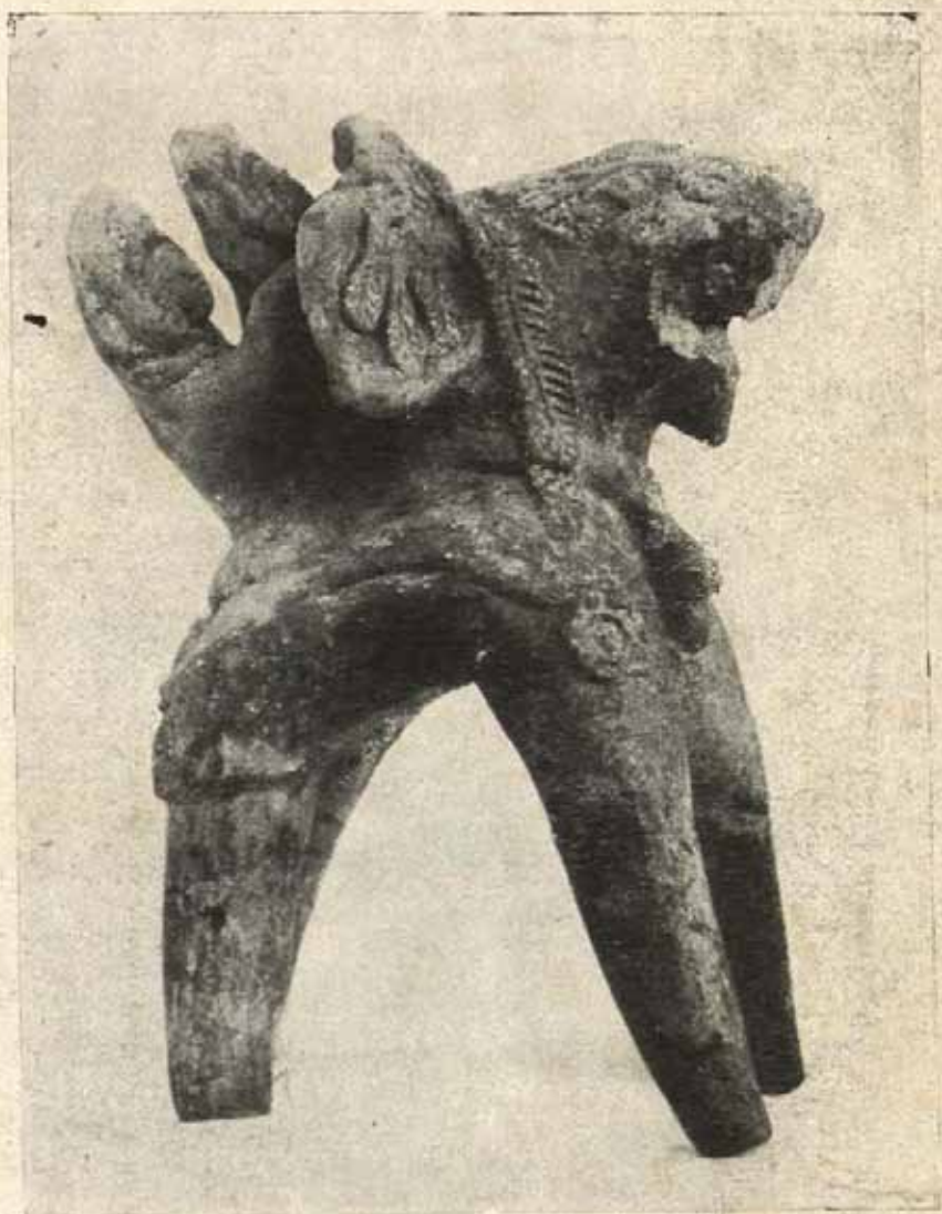
No. 3408—(c) Terracotta elephant with two male riders.