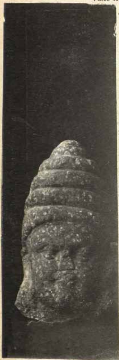
No. 3445—(a) Male head with a prominent long turban