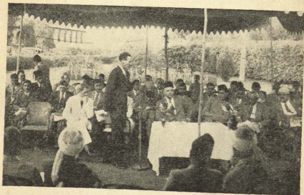
Dr. R. E. Mortimer Wheeler, M. A., C. I. E., M. C., Archaeological Adviser, Government of Pakistan, reading his inaugural address.