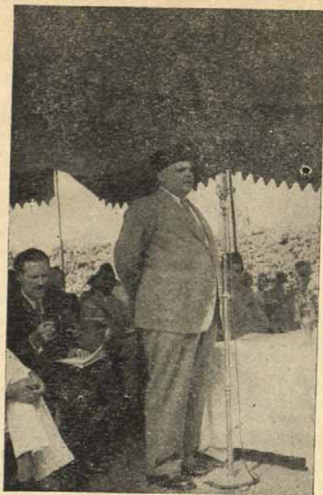
The Hon'ble Khan Abdul Qaiyum Khan, Prime Minister, N.-W. F. P., delivering his presidential address.