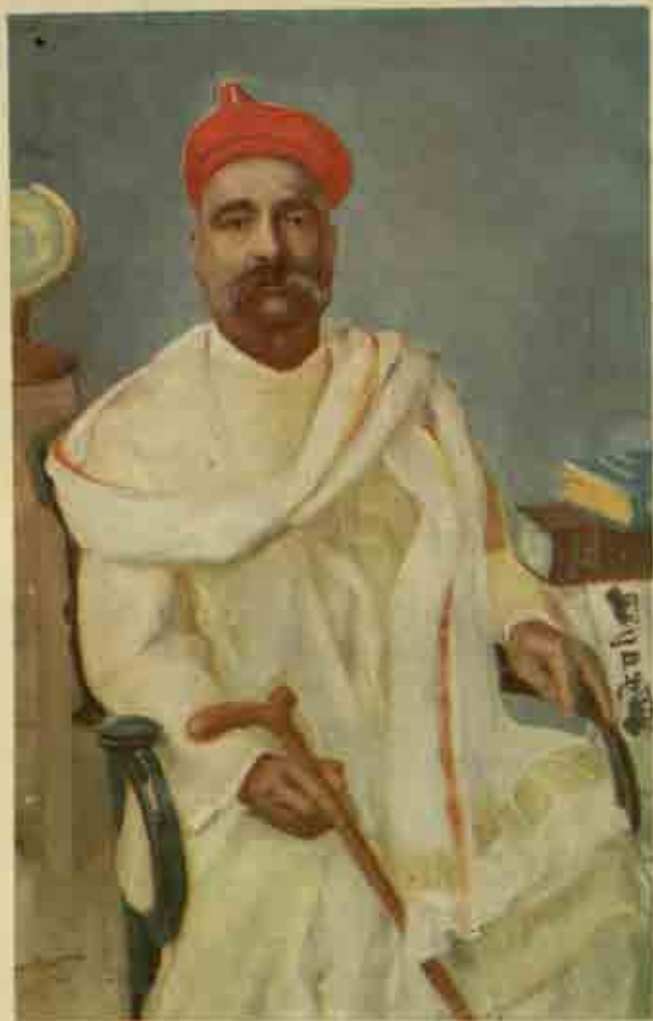
LOKAMANYA BAL GANGADHAR TILAK.