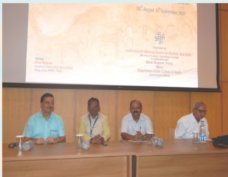
Delegates on Dais