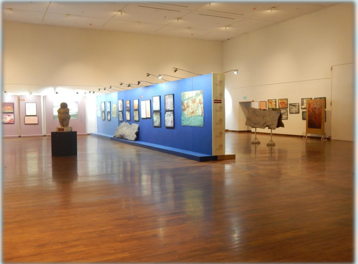
The World of Rock Art Exhibition Gallery, Bihar Museum, Patna