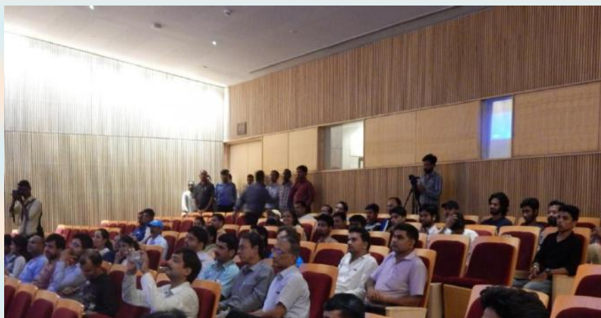
Scholars and University students attending Special Lecture