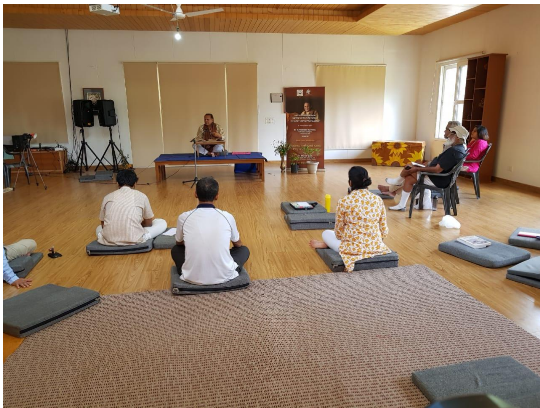
Participants During Workshop