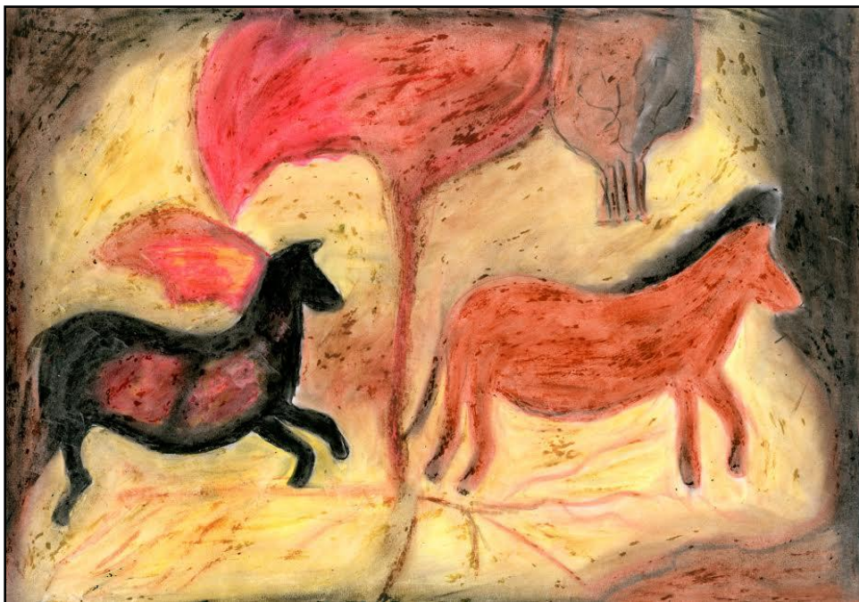
Shiwanjali Vishwakarma, 8 (C), A P SI, Nehru Road