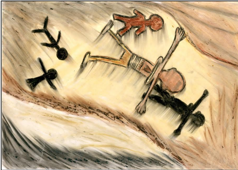
Twinkle Baranwal, 8 (C), A P S, Nehru Road