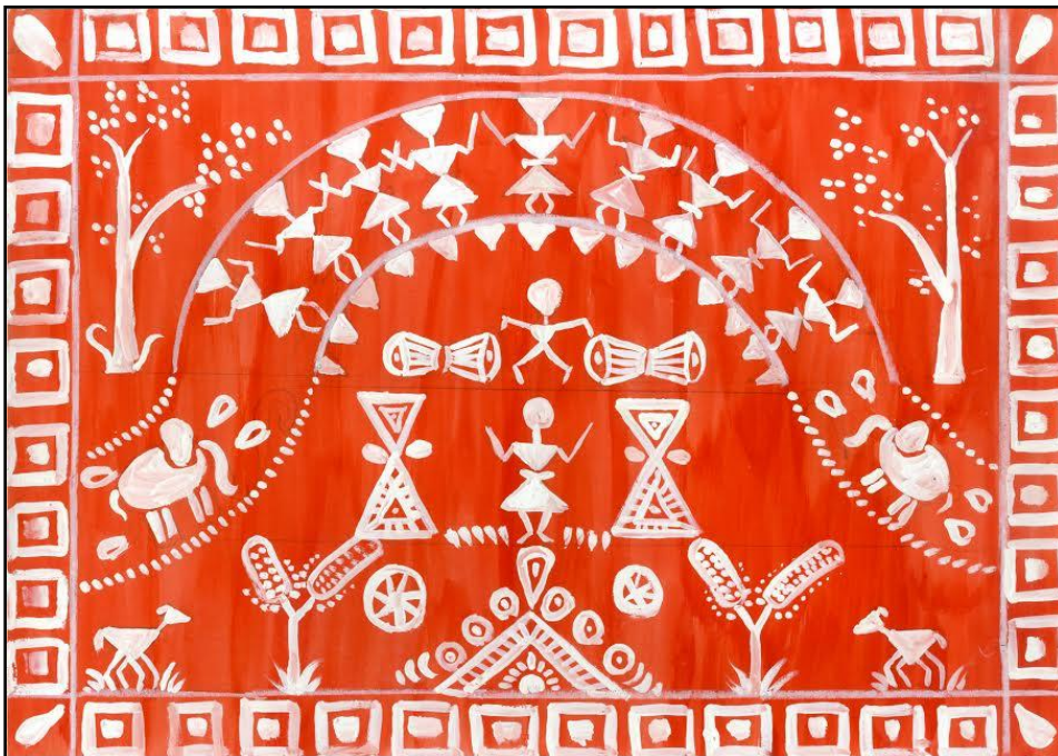
Saher Siddiqui, 8 (A), A P S, Nehru Road