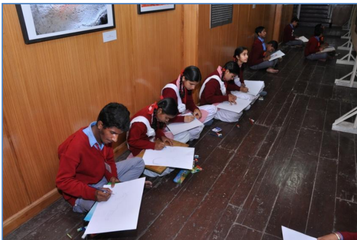
Govt. High School, Chaura Maidan.