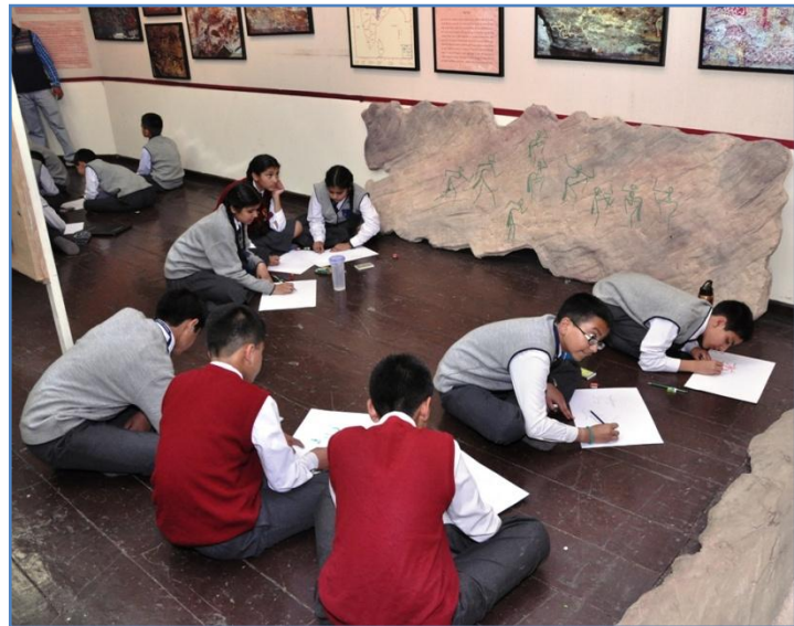
Dayanand Public School