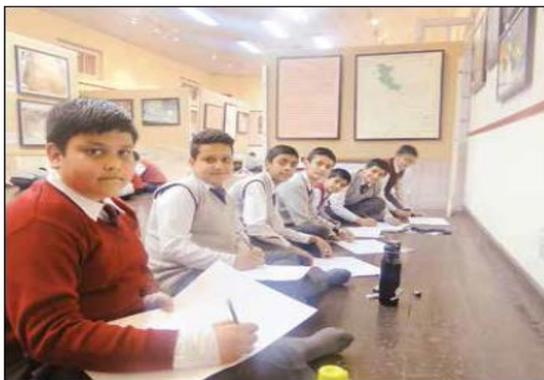
राज्य संग्रहालय में चित्रकला प्रतियोगिता में भाग लेते स्कूली बच्चे।

लोगों को वर्ल्ड रॉक आर्ट के बारे में बताना है। प्राचीन भारत की क्षेत्रीय जनजातियों जिनमें राठवा समुदाय गुजरात, वरली महाराष्ट्र, सौरा उड़ीसा को दर्शाया गया है। इसके अलावा इसमें पांच महाद्वीपों के रॉक आर्ट्स को भी बताया गया है। इसमें चीन, पाकिस्तान, जापान आस्ट्रेलिया, अमेरिका के देशों के रॉक आर्ट को भी दर्शाया है।