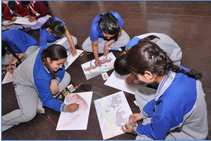
Gurukul International School.