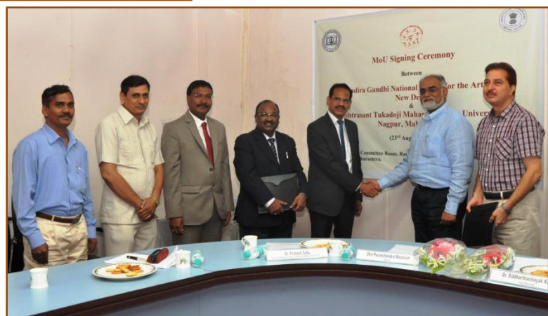
MoU signing ceremony between IGNCA and RTM Nagpur University.