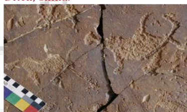
Yak figures from, Rutok, Upper Tibet

The art of even later periods of both the countries have witnessed the interchange of thought currents and artistic exchanges. For example, Dazu has the glimpses of ancient cultural undercurrent between India and China. The rock art of western Indian Buddhist caves and the sculptural and painted art traditions of India inspired the rock art of China at many sites including the grottoes at 70 sites in Chongqing's Dazu County forming a large ritual site of Tantric or mystic Buddhism. The amazing grottoes and painted sculptures of Avalokitesvara, Amitabha, Manjusri,