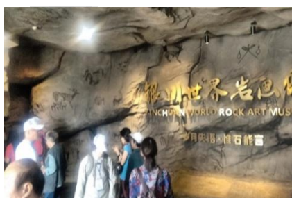
Entrance of Rock Art Museum, Yinchuan

After the inaugural function the delegates were shown the recently established rock art galleries of the World Rock Art Museum. The multimedia display of the museum is beautifully planned continent wise, an attempt has been made to create a prehistoric environment in the museum. The display is not only beautifully planned but educative also. IGNCA can get some lessons from its display which we may experiment in our proposed rock art park and rock art gallery.