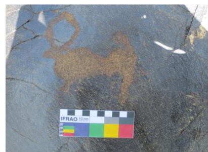
Yak engraving at Domkhar, Ladakh.