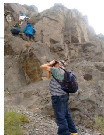
Delegates on field investigations