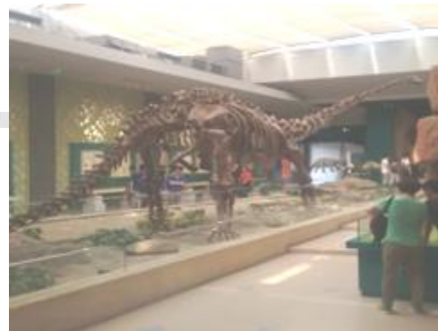
A representative display of painted Pottery, Paleontological Fossil, Buddhist Art and Revolutionary History of Gansu at Gansu Provincial Museum, Lanzhou