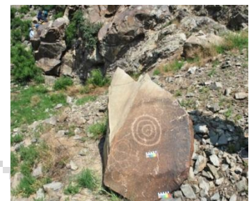
Helan Mountain rock art