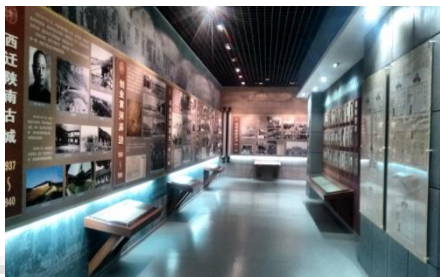
Displays showing history of University at Northwest Normal University Museum