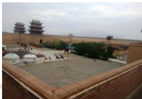
General view of Jiayuguan pass

On 23 rd July, 2017 afternoon we landed in Lanzhou, the capital of Gansu province. We were the guests of the Northwest Normal University at Lanzhou. Credited as “the Cradle of Teachers Education in Western China”, Northwest Normal University (NWNLU) is a major university under the joint administration of the People’s Government of Gansu Province and the Ministry of Education of China. It is also one of the 14 state-supported universities in Western China.