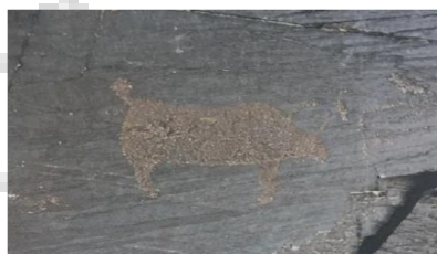
Engraving of a Yak at Sidaouxing Ditch, China.

Yaks are the main rock art images in the Qinghai-Tibet plateau. These animals are found in the high altitude region. Within the rock art of this area, there are many images of the yak, which is considered a religious symbol to these people. Prominent engravings of yaks are also found in the petroglyphs at Spiti and Ladakh region. A bird figure usually found engraved on the boulders in the regions of Qinghai plateau, Spiti valley and Ladakh region is known as Khyung, a mythical bird venerated in the traditional Bon religion. In the ancient Zhang-Zhung culture, there is evidence that this bird was worshipped. Sun, moon, trees and birds were the representative of original Bon religion in which nature and natural forces were worshipped. The same bird is depicted in rock art of Himalayas (Ladakh, Spiti) and Tibetan plateau. The similarity of themes like concentric circles, anthropomorphs, deer, mascoïds and other geometric designs are found in the rock art of Jiangtai and rock art of north-west of India.