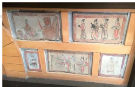
Paintings of Wei and Jin Dynasties on tiles at Wei-Jin Art Gallery (Interpretation Centre of Under Ground Gallery)

On 21 st July, 2017 a visit to Under Ground Gallery – Wei Jin Brick Mural Tomb of Han and Jin Dynasty was made. Located about 18 kilometres northeast of Jiayuguan, Wei-Jin Brick Mural Tomb is a big tomb group with over 1,400 tombs built between the 3 rd to 5 th centuries during the Wei and Jin dynasties. Renowned as the largest subterranean art gallery in the world, it reflects the political, cultural, military, and scientific