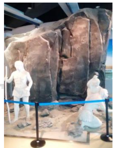
Displays of Silk route caravan and a replica of rock art site in Gansu Province at Jiayuguan City Museum