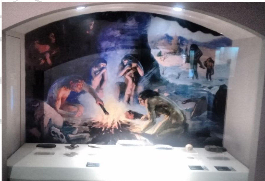
Display showing human evolution at University Museum

and fauna, etc. in a very systematic way, while creating the gallery/theme specific environment for display, while using multimedia very efficiently and effectively. A visit to the museums in China is highly enriching.