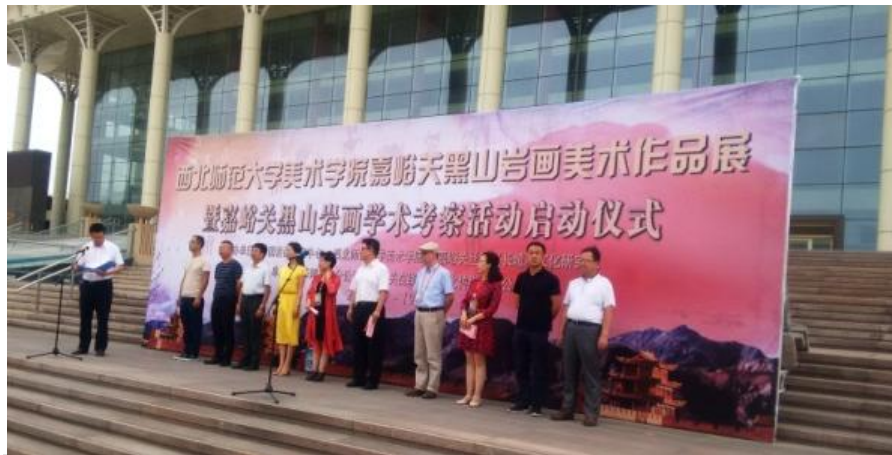
Mayor of the Jiayuguan inaugurating Heishan Rock Art symposium

On 19/07/2017 morning, the 2017 Heishan Rock Art symposium was formally inaugurated by the Mayor of the Jiayuguan at Jiayuguan Cultural centre. It was followed by a visit to an exhibition on rock art, organised by the students of the university at the same venue. After it, the delegates visited the City Museum.