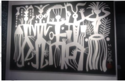
Painting at Han Meilin Art Museum

Soon after the visit to World Rock Art Museum, the delegates were taken around the Han Meilin Art Museum. This museum has been established in the name of leading artist of China, Han Mei Lin, who was Chief Guest during the inaugural function. The museum displays all the personal collection of the artist which he has made in different mediums. His creations are inspired from the earliest rock art to modern to contemporary art forms.