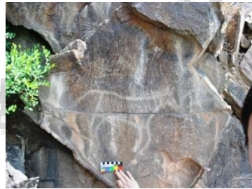
Engravings at Gao Fu Pass of Helan Mountain

On 17/08/2017, the delegates were taken to a rock art site- Gao Fu Pass of Helan Mountain. The Helan Mountain stretches 250km from the south to north, blocking the Tengery desert as a natural barrier and known to be an oasis of the hinder land. Since ancient times, this region was