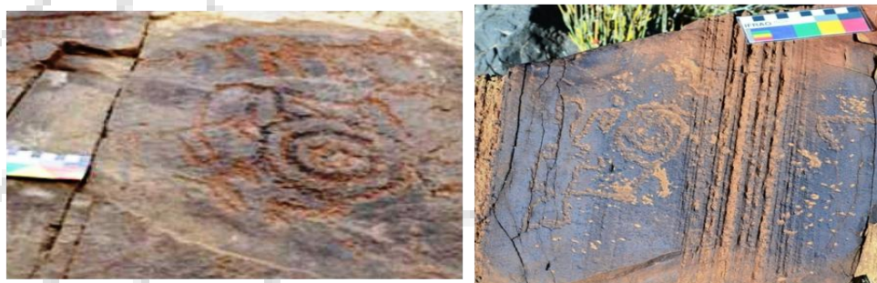
Engravings of concentric circles and animal figures at Huangya Gou (L) and Spiti, Himachal Pradesh(R).

Archaeologically speaking, Kashmir had a highly developed Neolithic culture spread throughout the length and breadth of the valley. The investigations in high altitude Ladakh for last couple of decades have brought to light a large number of petroglyphs from different areas mostly confining to the ancient routes and passes connecting two valleys in Ladakh and also connecting Ladakh with surrounding areas particularly Central Asia. It is interesting to note that in Nubra valley the ancient route to Karakoram and further beyond to China lies on the left bank of river Nubra near village Sasoma. This evidence not only establishes the early human contact with neighbouring areas, but also establishes human movement within the valley. Rock art of Himalayas and Tibetan plateau and its adjacent areas in China have definite connections. That is why we find universality of content and style in the rock art of Heishan, Jingtai and of other places of China and rock art of India, especially from the Himalayan region (Ladakh, Spiti etc).