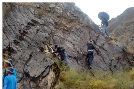
Field trip to Black Mountain Montenegro.

scenes as well as many in sheep, cattle, deer, dogs, camels, birds, chickens, fish and other animal images. Montenegro rock painting is the unique cultural heritage and cultural landscape of the city. It occupies an important position in the world of rock paintings, whose long history, profound connotation, exquisite art is amazing.