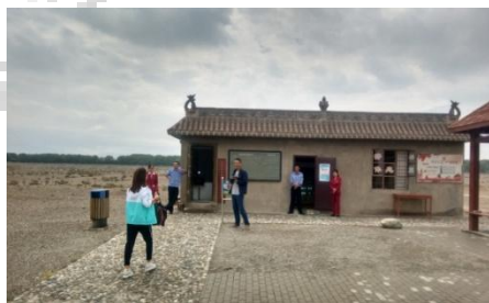
A view of Wei-Jin Brick Mural Tomb (Under Ground Gallery)

Shiguanxia (pass) and Muozigou sites was made. These two sites are very significant in the Heishan Rock Art of Gansu province.