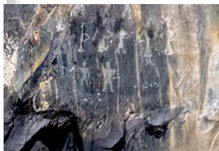
Depiction of dancing figures on rock surface at Black Mountain Montenegro.

On 19/07/2017 afternoon, we had a field trip to Black Mountain Montenegro rock paintings called "Montenegro cliff shallow stone carving", located in the northwest of Jiayuguan about 10-20km of the Montenegro Canyon steep cliffs, is believed to be a real life record of nomadic production area of Montenegro in ancient times. Contents depicted are hunting, riding and shooting practice,