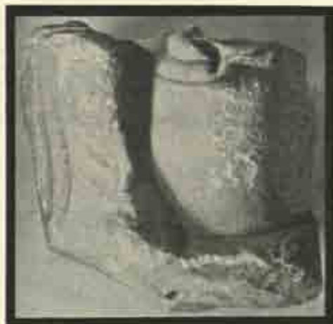
No. 1236 (a).

There are two holes, each .01 m. in diameter underneath near the base of the drum.