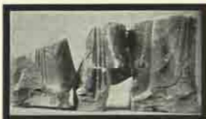
No. 1341 \beta and \gamma .

1341 \gamma . The lower part of the legs of a female figure similar to the preceding, moving to the left in the same way and wearing the same garments. The feet are missing.