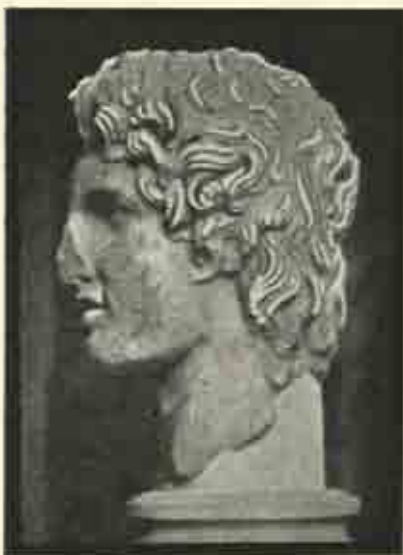
No. 1331 (a).