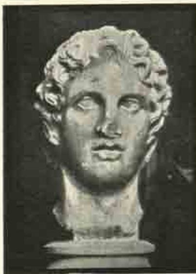
No. 1331 (b).