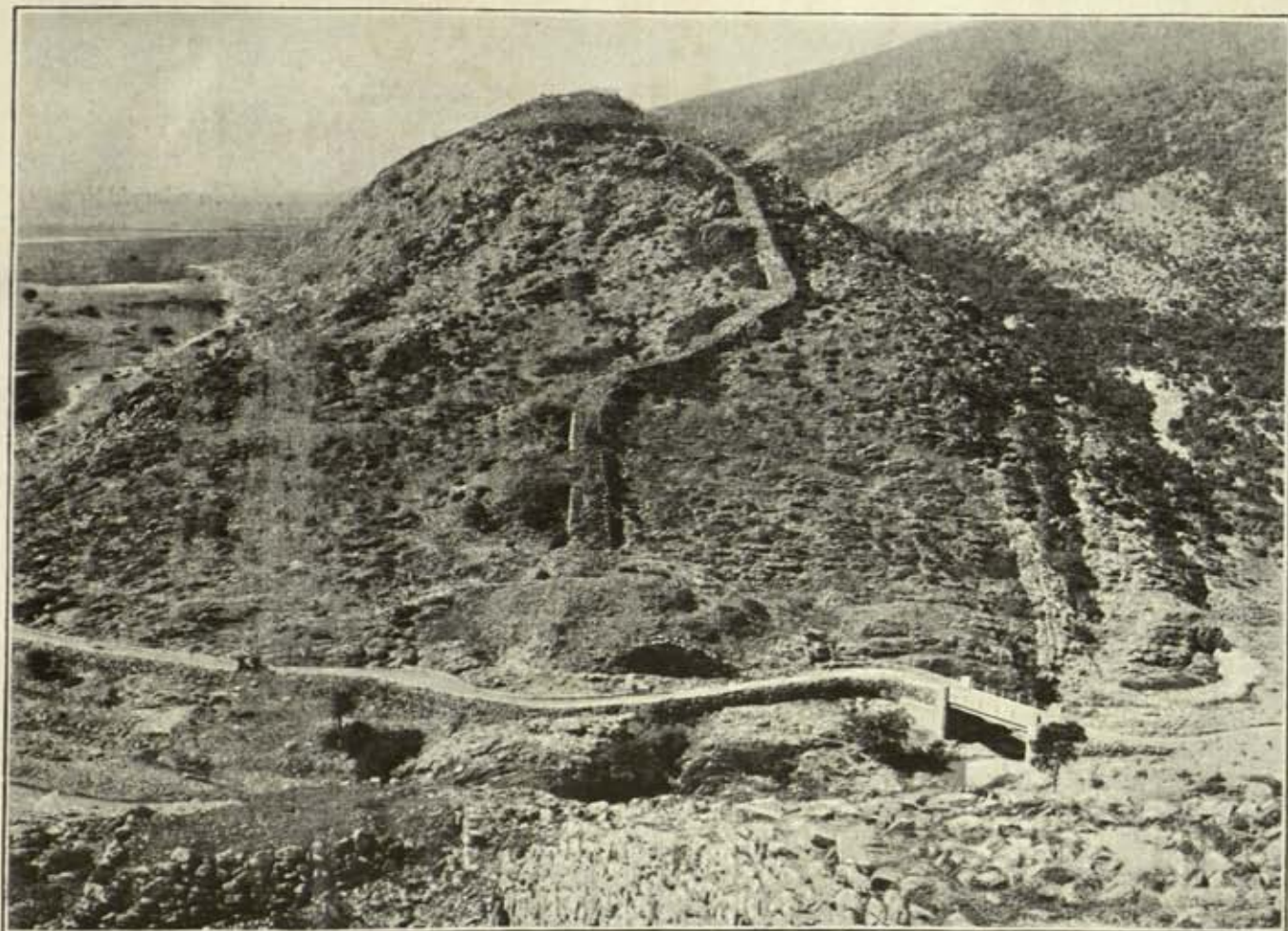
(a) RAJGIR: SONAGIRI WITH THE CYCLOPEAN WALL ON IT, AS SEEN FROM UDAYGIRI.