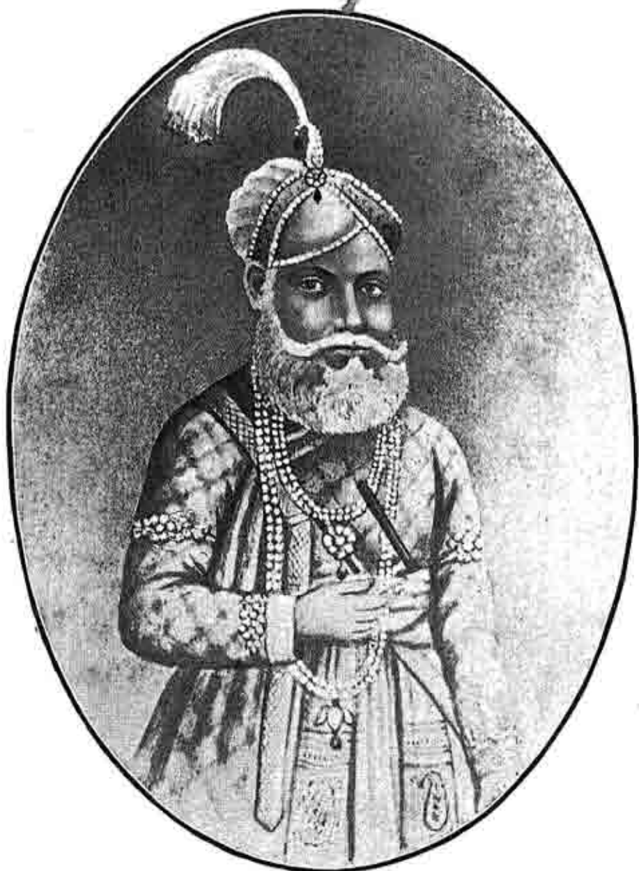
Nawwāb Sirāju'd-Dawla Hājī Muḥammad Khān-i-Juhān Anwaru'd-Dīn Khān Bahādur Shahāmat Jang .