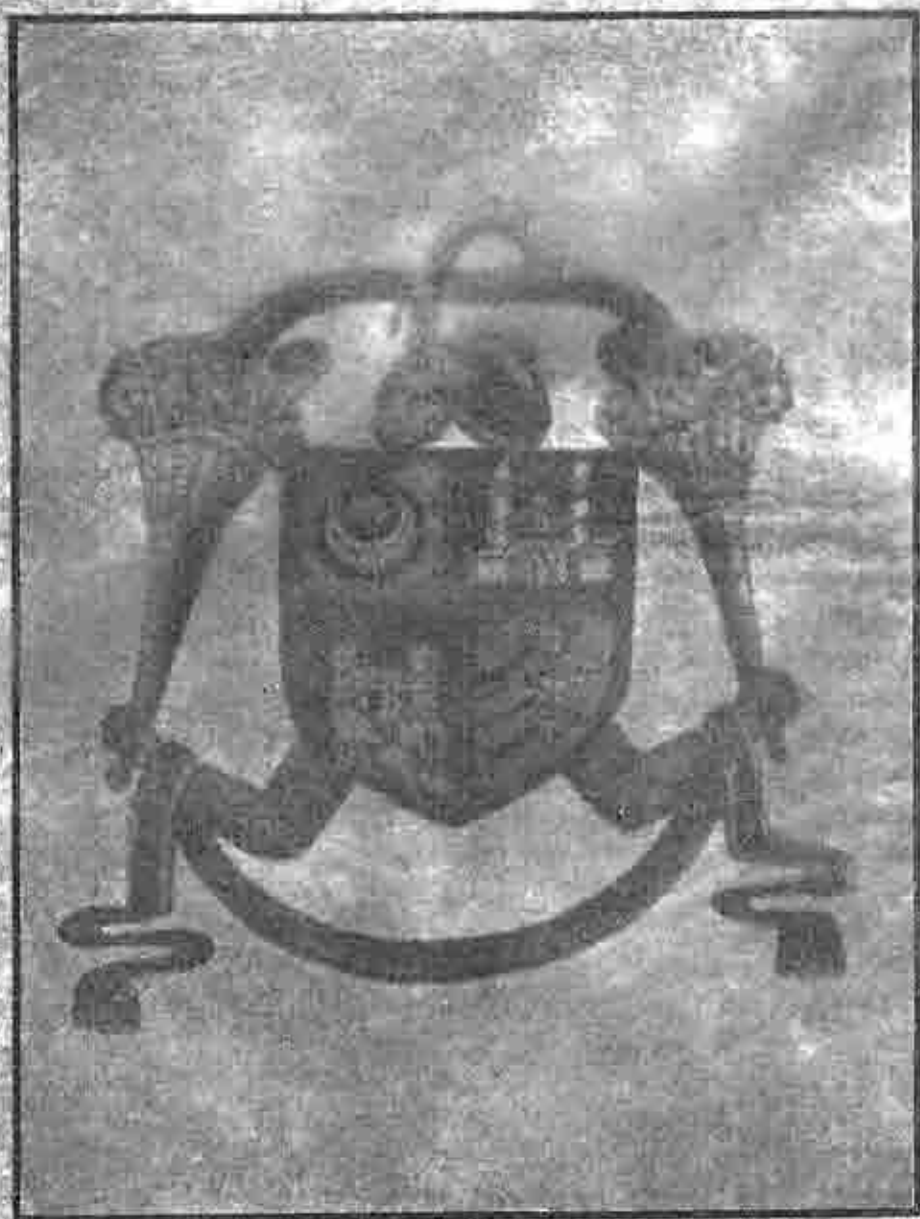
CREST OF THE NAWWĀBS OF THE CARNATIC