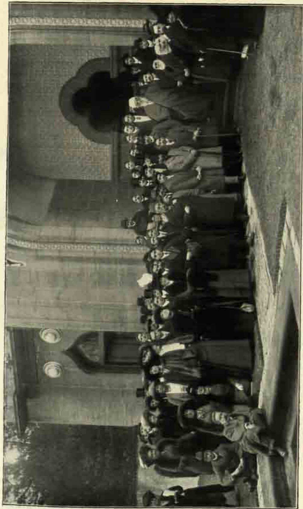
GATHERING AT THE MOSQUE, WOKING, ON THE OCCASION OF THE VISIT OF ABDUL KAHAR, JANUARY 17, 1913.