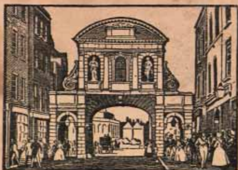
Old Temple Bar : from a Drawing by H. K. Rooke