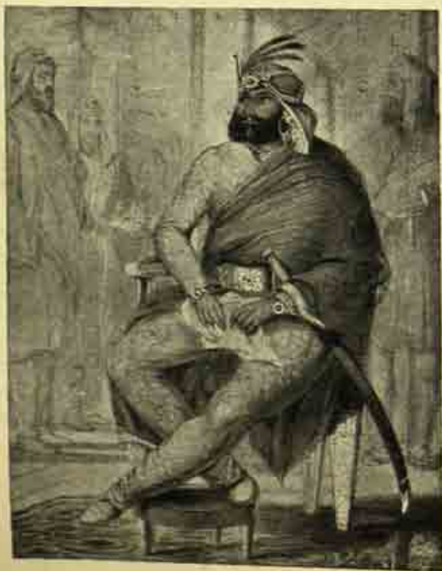
Maharaja Sher Singh