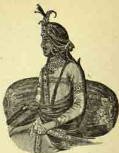
Kanwar Nau-Nihal Singh