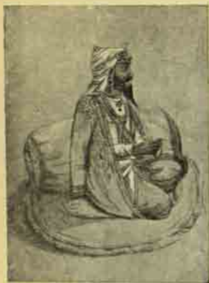
Maharaja Kharak Singh