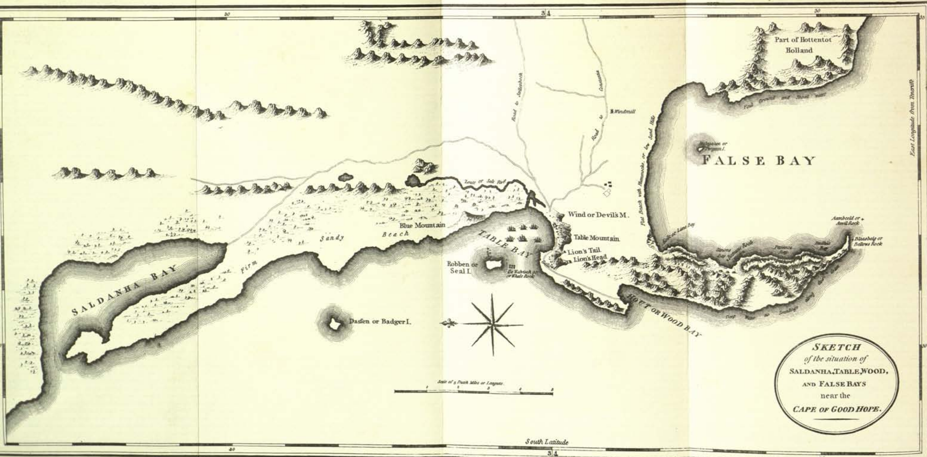
SKETCH of the situation of SALDANHA, TABLE, WOOD, AND FALSE BAYS near the CAPE OF GOOD HOPE.