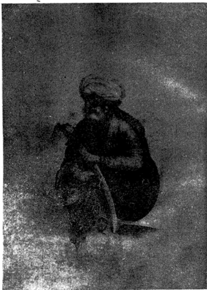
MAHARAJAH GOOLAB SINGH