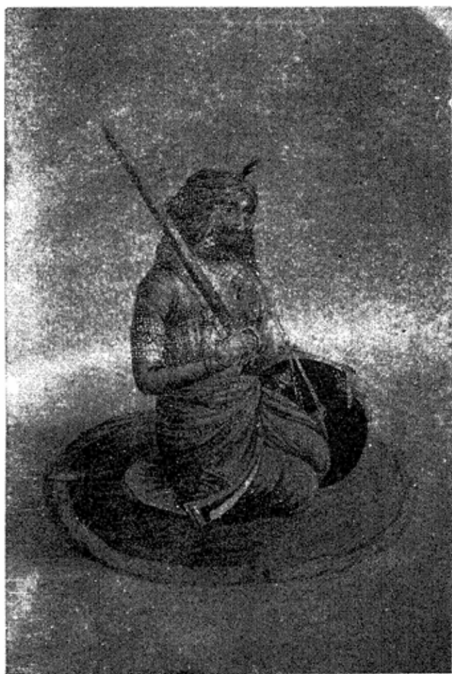
RAJAH SOOCHET SINGH