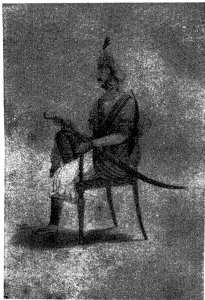
NO NEHAL SINGH