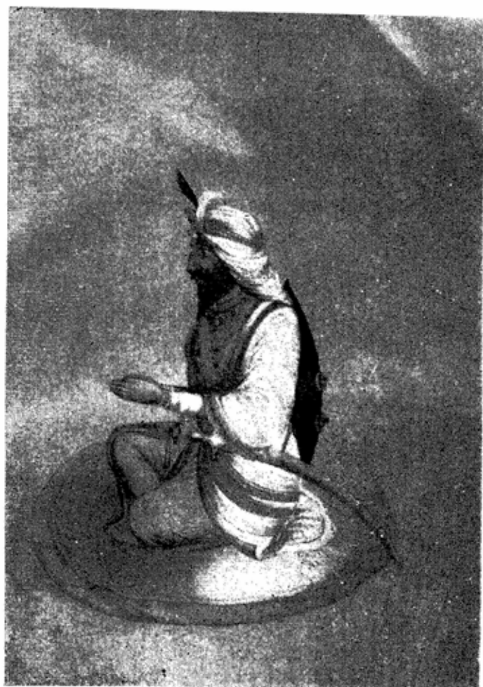
RAJAH DHYAN SINGH.