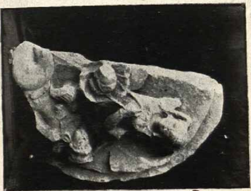
No. 3371—(b) Kalpa Dharma by Sri Krishna.