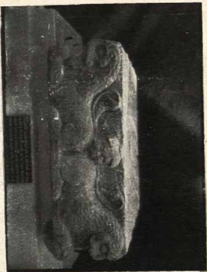
No. 3295—(a) Square base of a votive Stupa carved with lions and Buddha head.