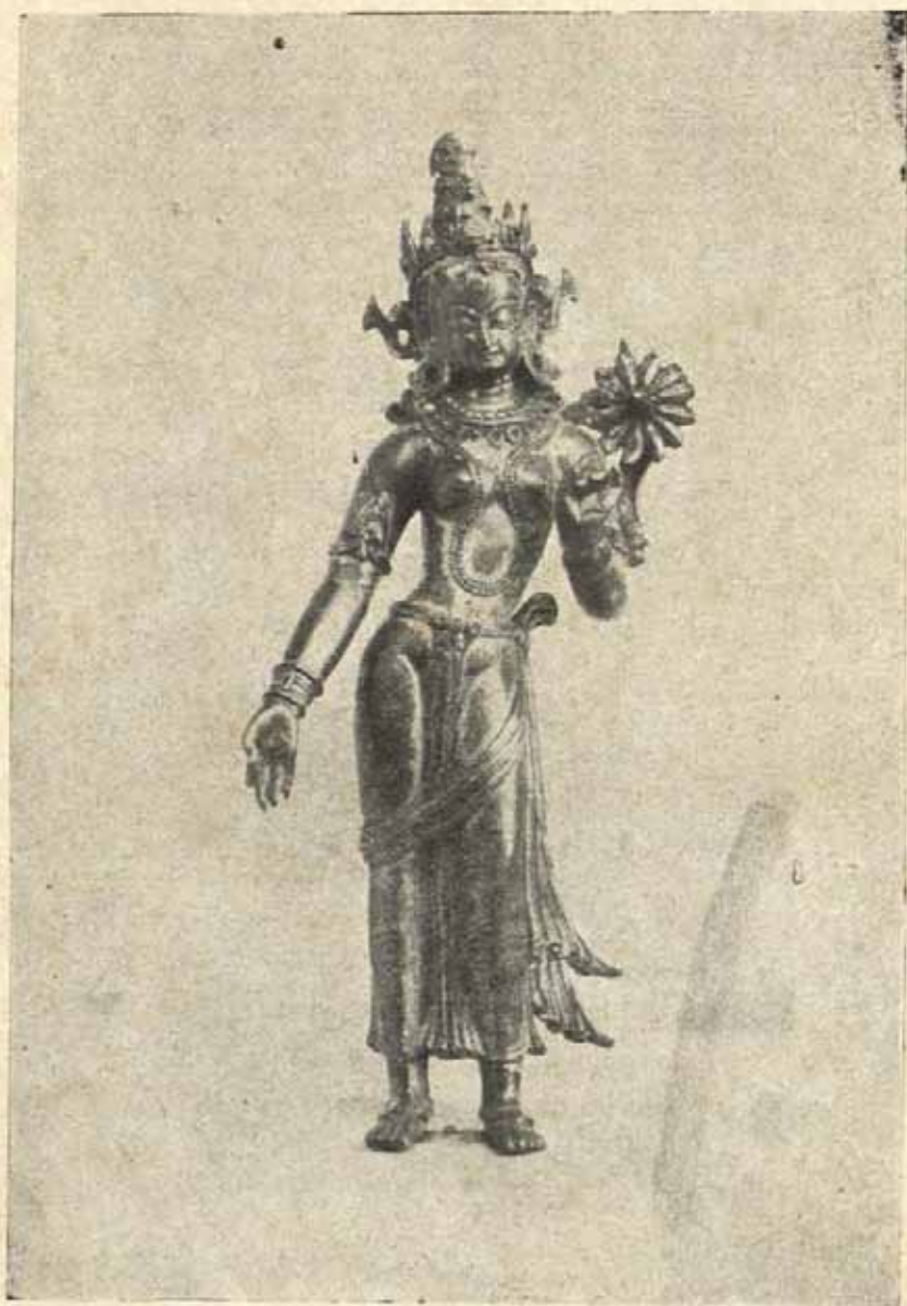
No. 3943—Gold-gilded bronze image of Buddhist goddess Tara.