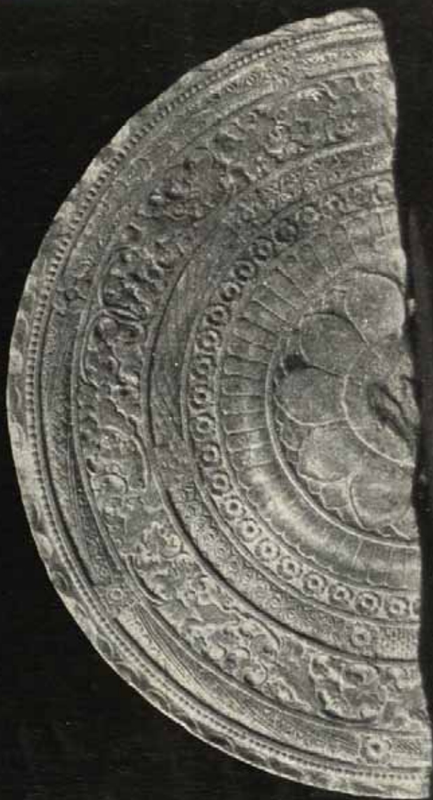
No. 328—Hail portion of a richly decorated halo of a Buddha figure