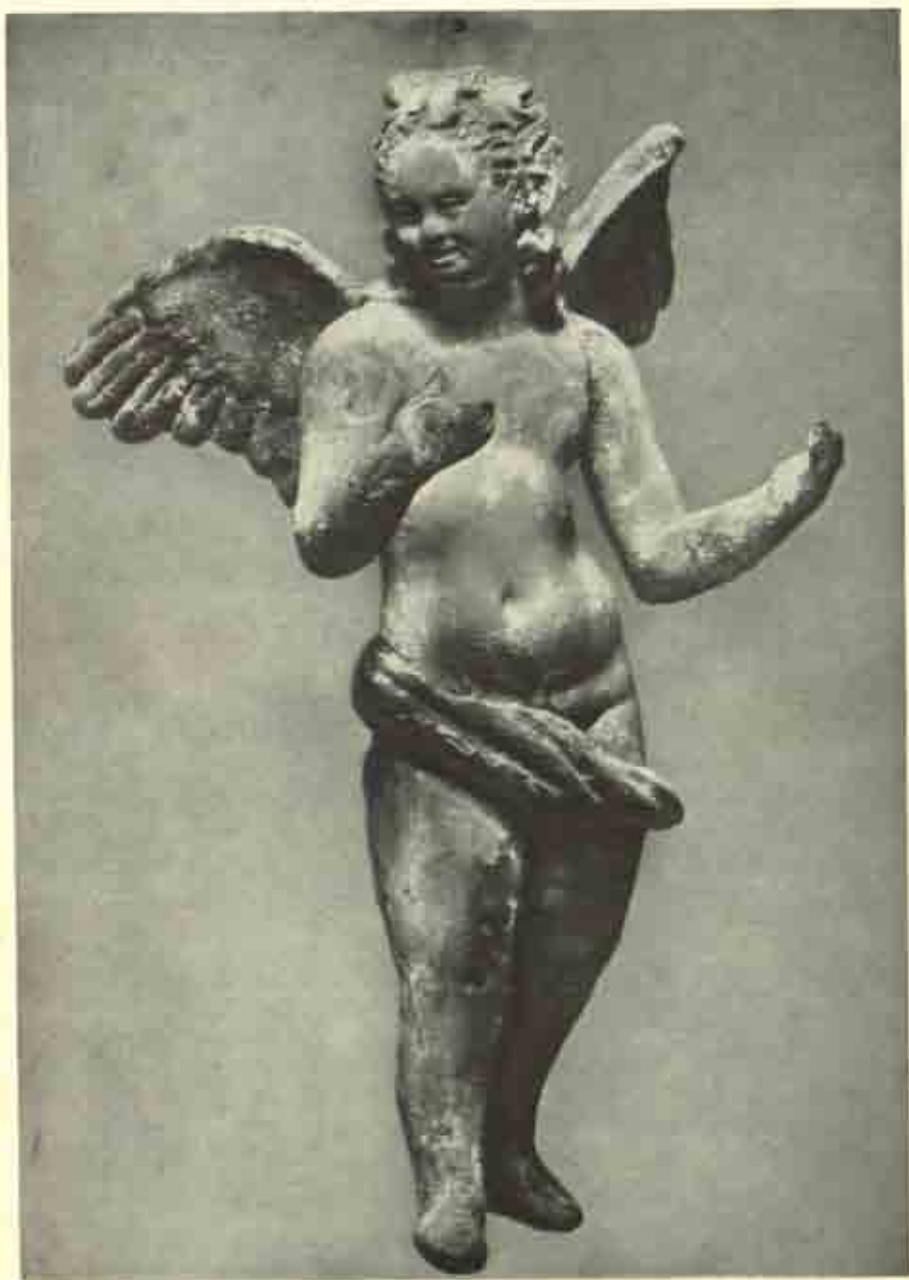
2. Winged Eros