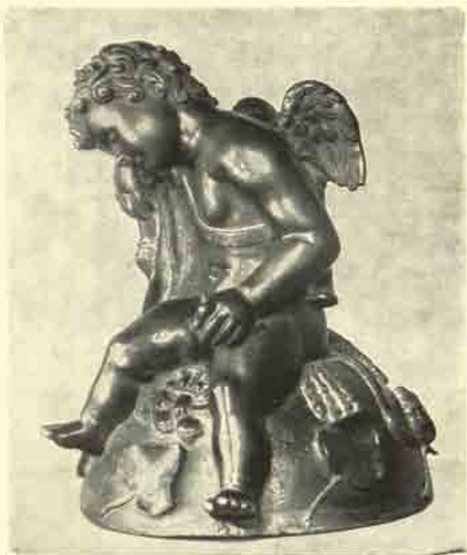
5. Sleeping Amor