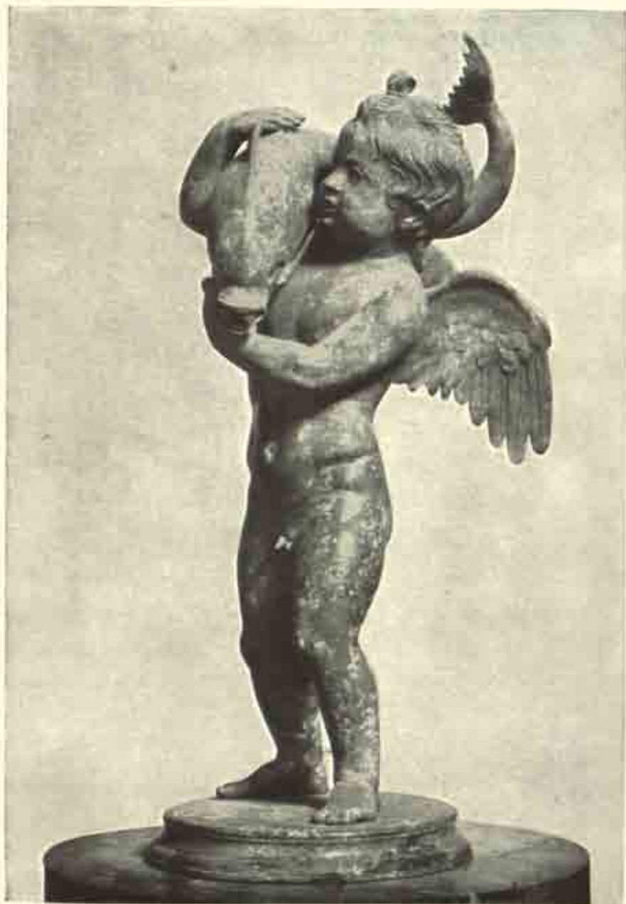
3. Putto with Dolphin