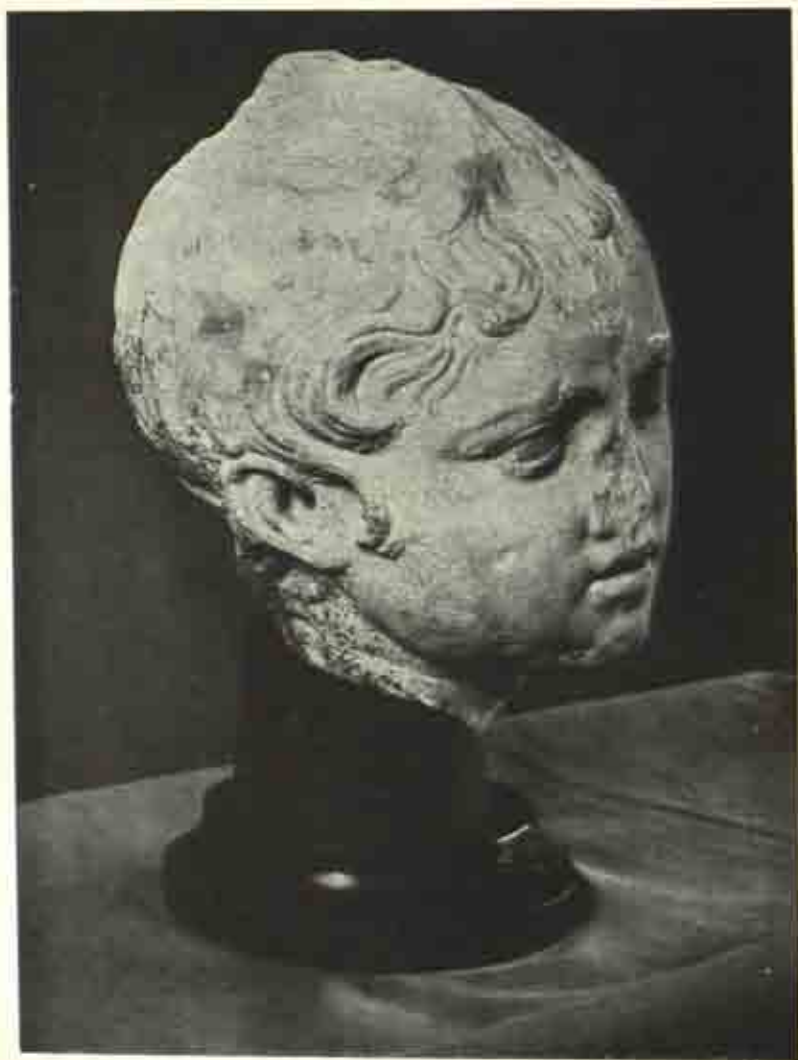
1. Head of a Bow-stretching Eros.