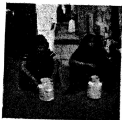
Women selling milk at Trimbakeshwar