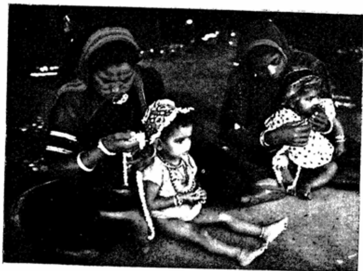
Women of Ningiri stringing 'Chapha' flowers