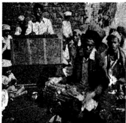
Bhajan party at Ningiri