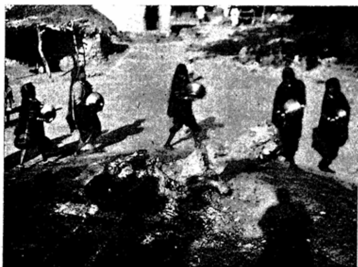
Women of Ningiri extinguishing the Holi fire