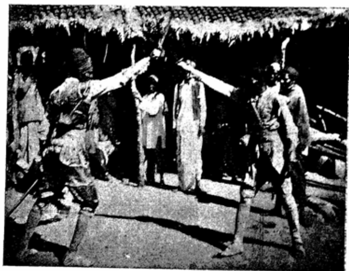
"Tamasha" troupe of Ningiri presenting a 'Vag'