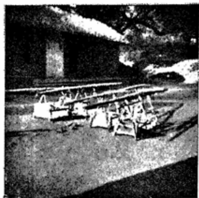
Sedan chairs at Trimbakeshwar