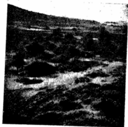
General view of a Mahadev Koli 'Wadi'