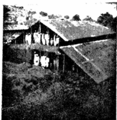
The house at Trimbakeshwar pro- posed to be turned into a 'Mahadev Koli dharmashala'