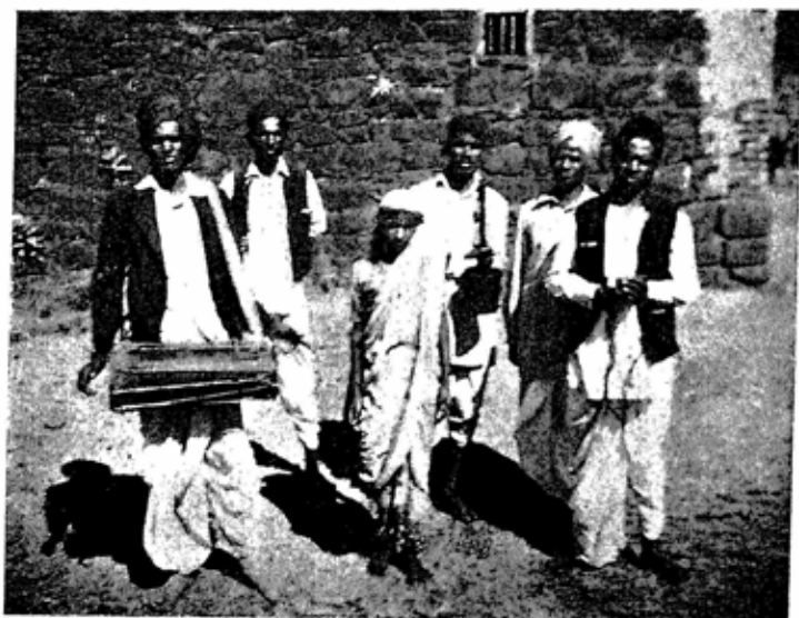
"Tamasha" troupe of Ningiri presenting a song