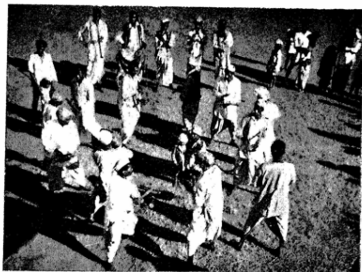
'Lezim' - players of Rajur, Dist. Poona (Playing to the accompaniment of a full band of Music)