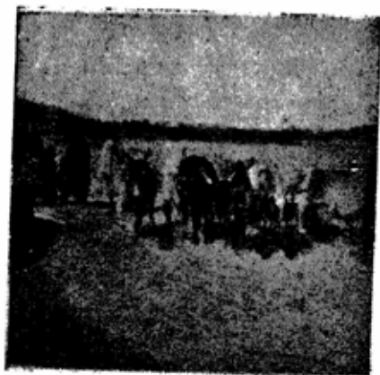
Threshing of 'nagli' at Devargaon