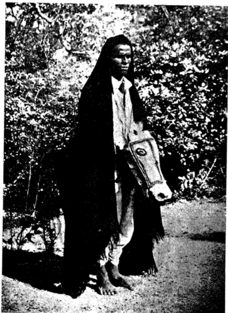
'Song' of a horseman in the Shinga festival at Nimgiri