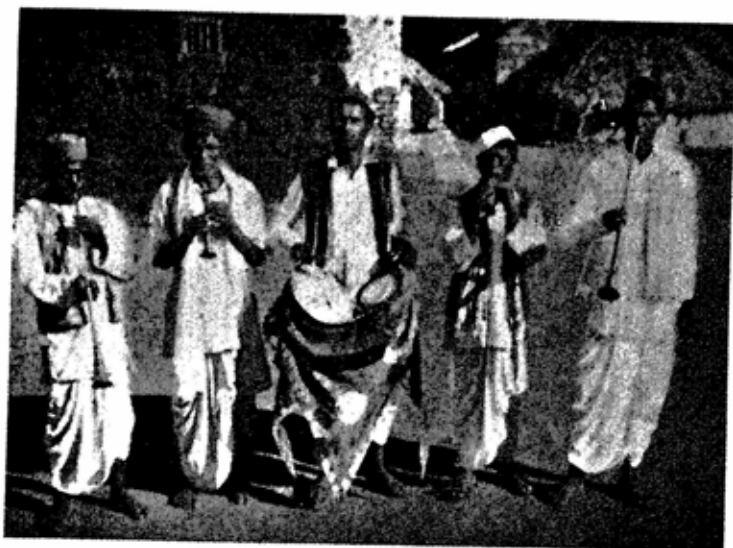
A band of Mahar Musicians from Ningiri