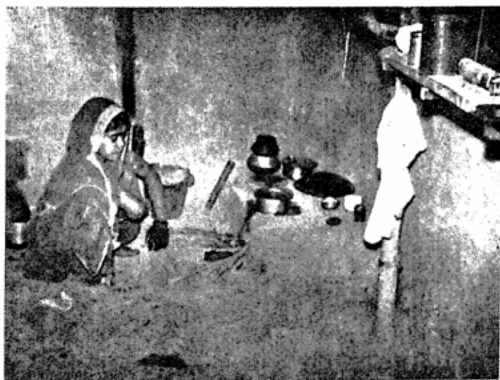
A newly-wed wife from Mulund in her kitchen