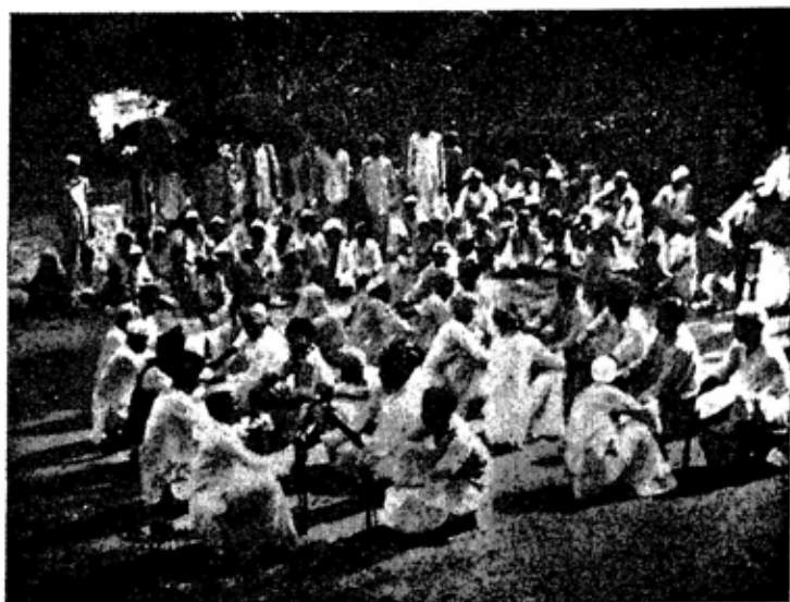
'Lezim' - players of Rajur, Dist. Poona (sitting posture)