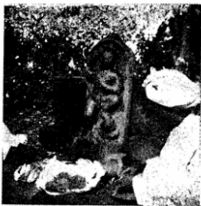
Worship of Maruti at Ningiri