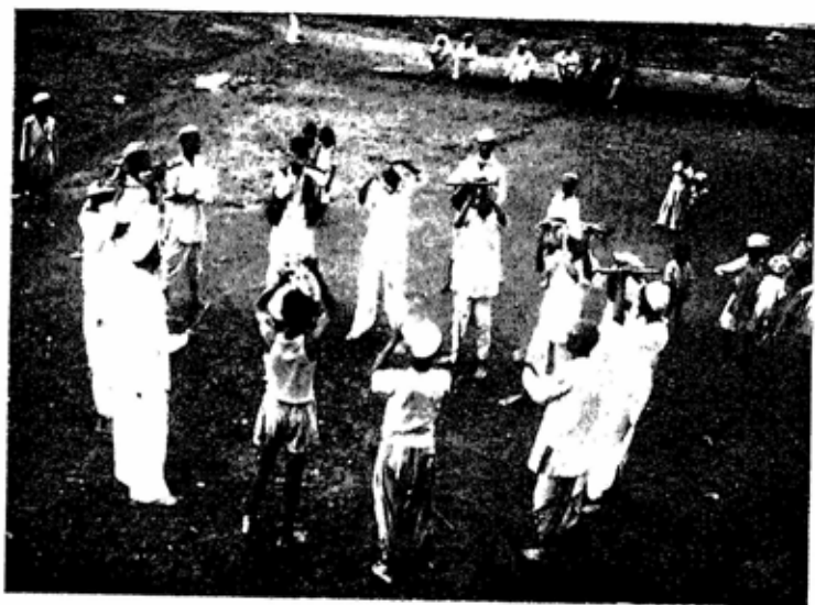
'Lezim' - players of Rajur, Dist. Poona (moving in a circle)