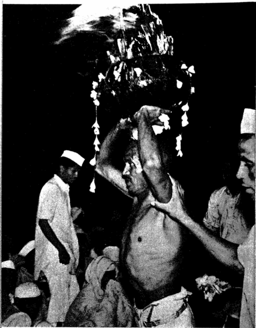
A 'bhugat' at Sakirwadi fair with the pot of live fire charcoal on his head.