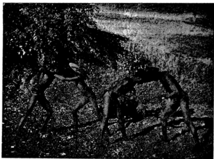
A group of wrestlers from Nimngiri