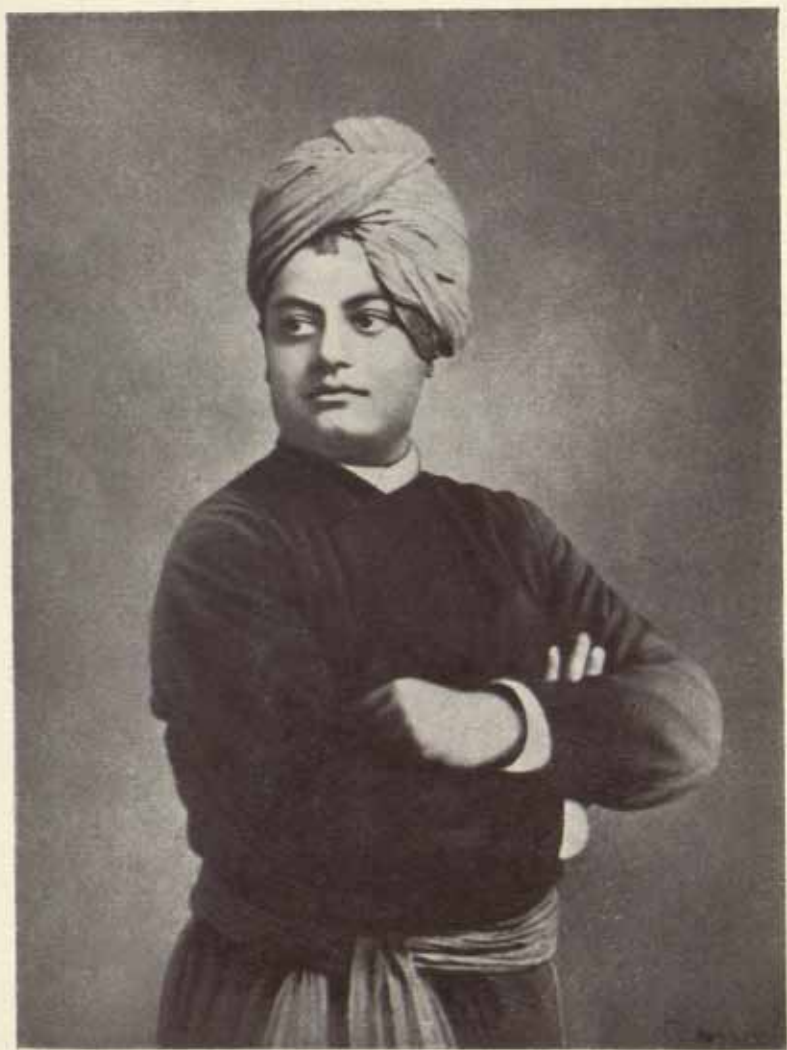
At the Parliament of Religions, Chicago, U.S.A. (1893)