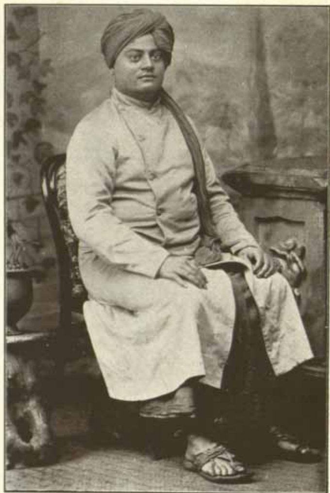
At Belgaum in October 1892