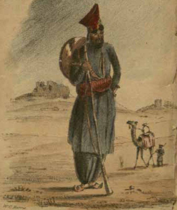
A COMMON CLASS SINDEAN