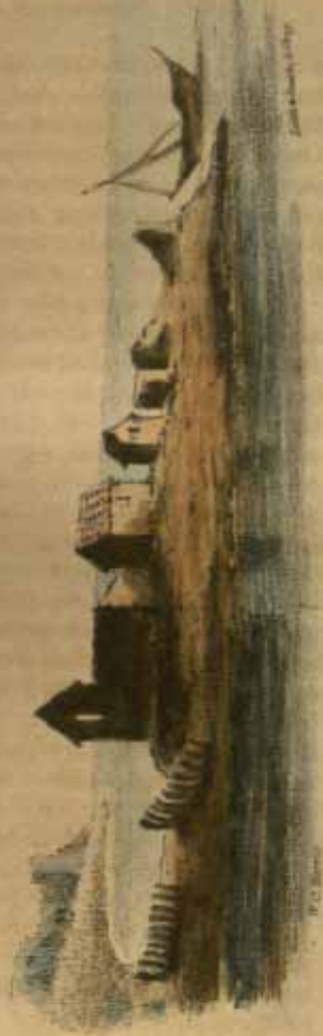
THE PORT NEAR LUCKPUT.