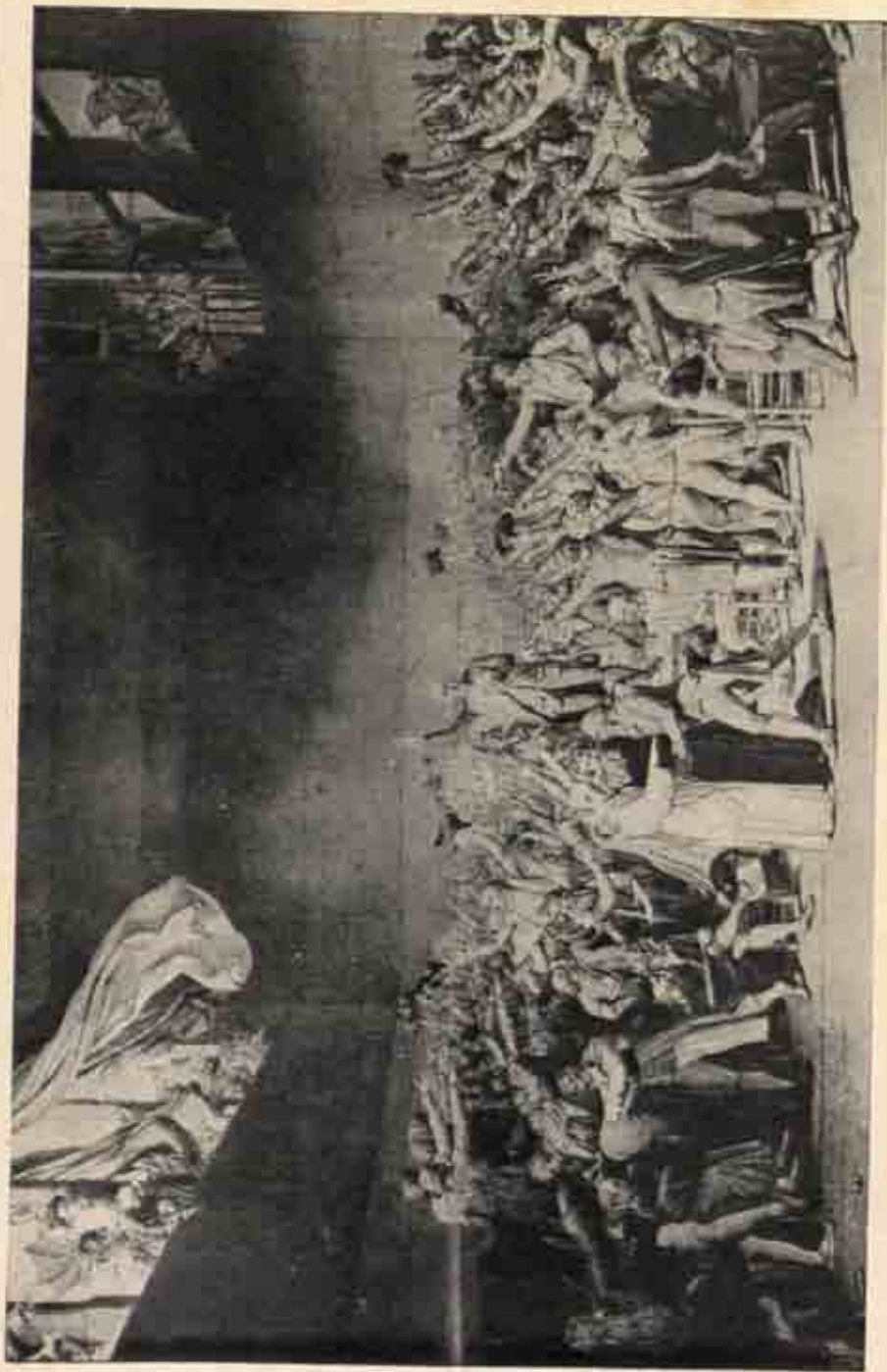
THE OATH OF THE JEU DE PAUME (Page 315)