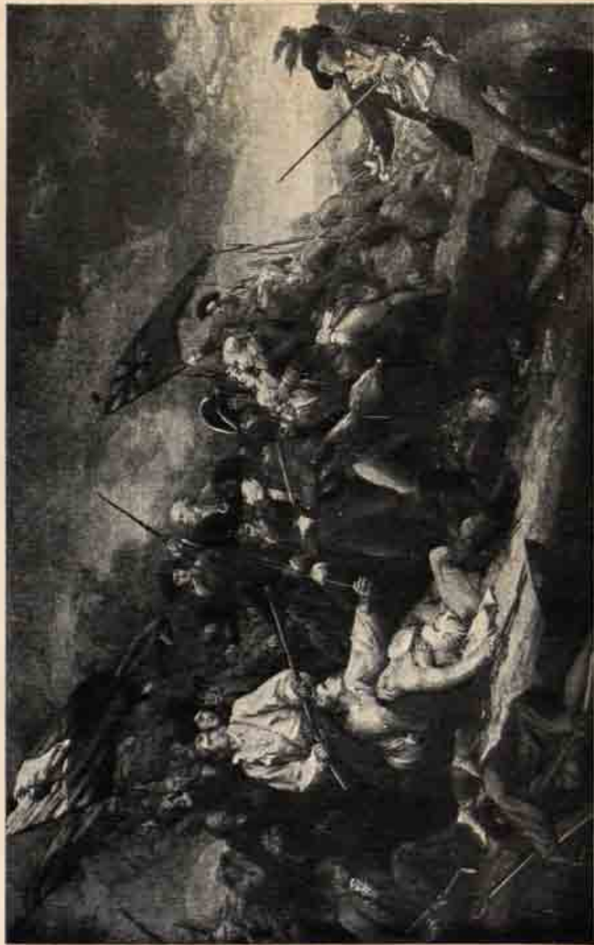
THE BATTLE OF BUNKER HILL. (Page 269)