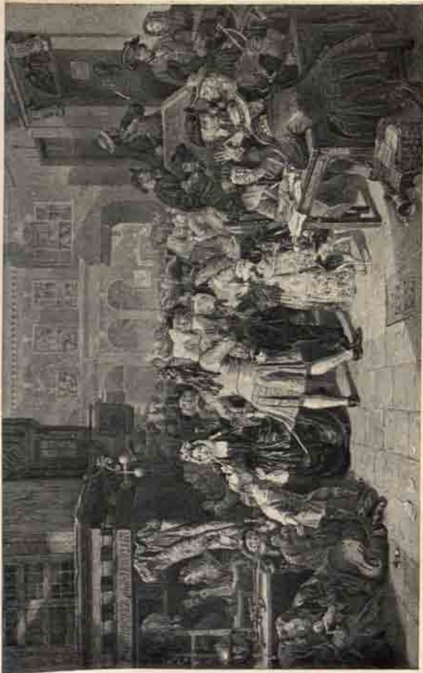
SPECULATIVE FEVER AT THE TIME OF THE SOUTH SEA BUBBLE. (Pages 133-145)