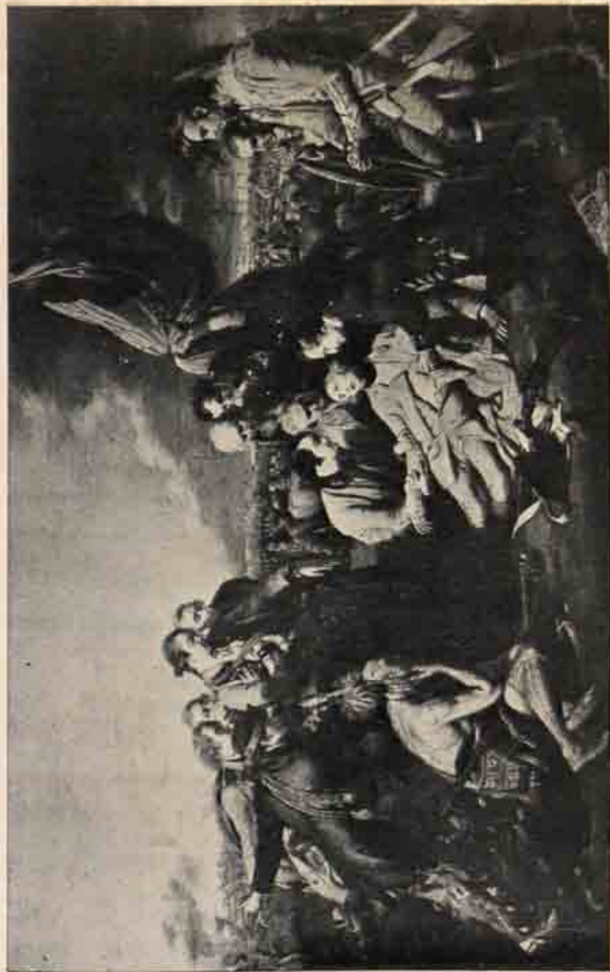
THE DEATH OF GENERAL WOLFE AFTER HIS VICTORY (Page 208)