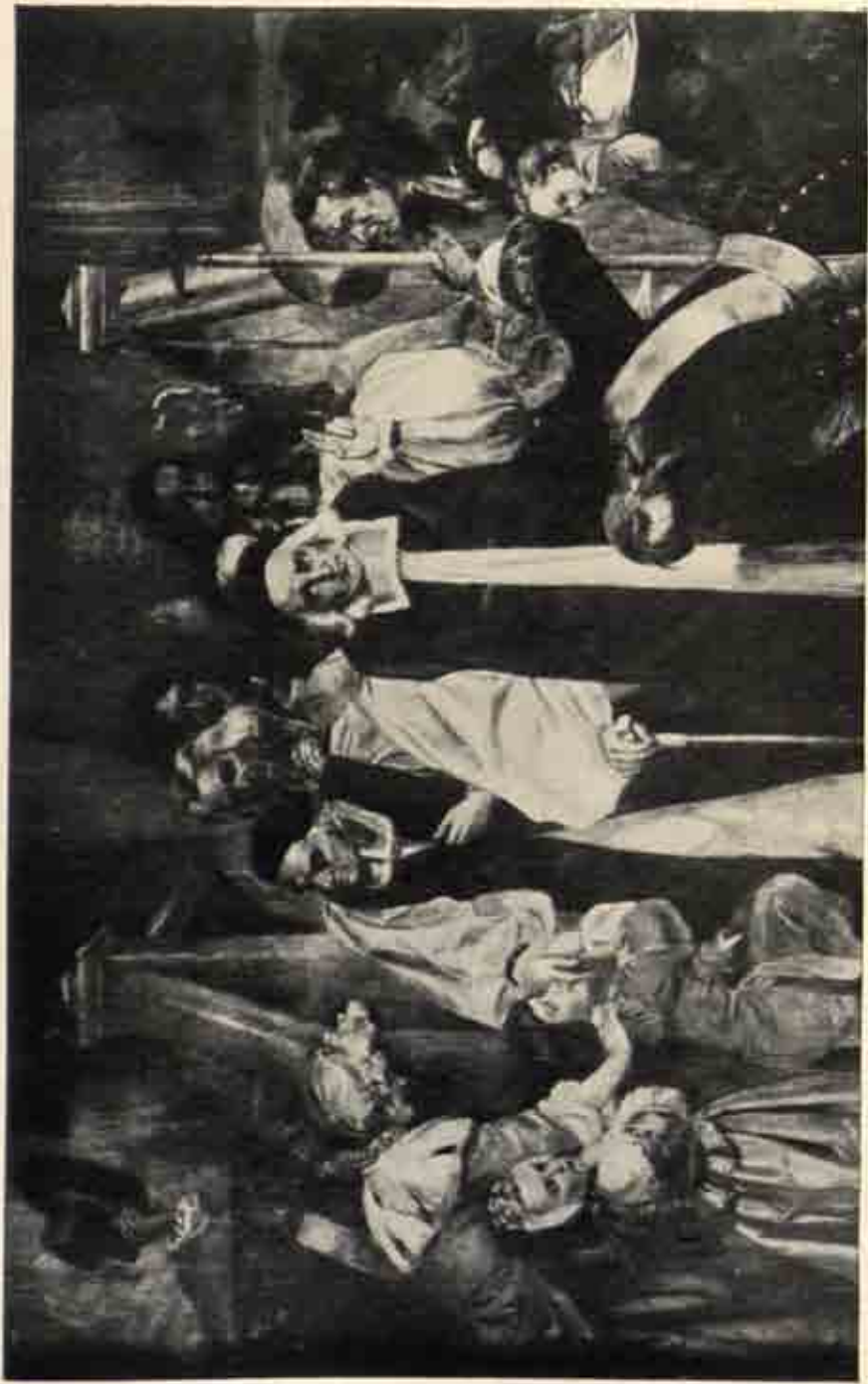
THE SEVEN BISHOPS LEAVING THE COURT AFTER THEIR ACQUITTAL ( Page 15 )