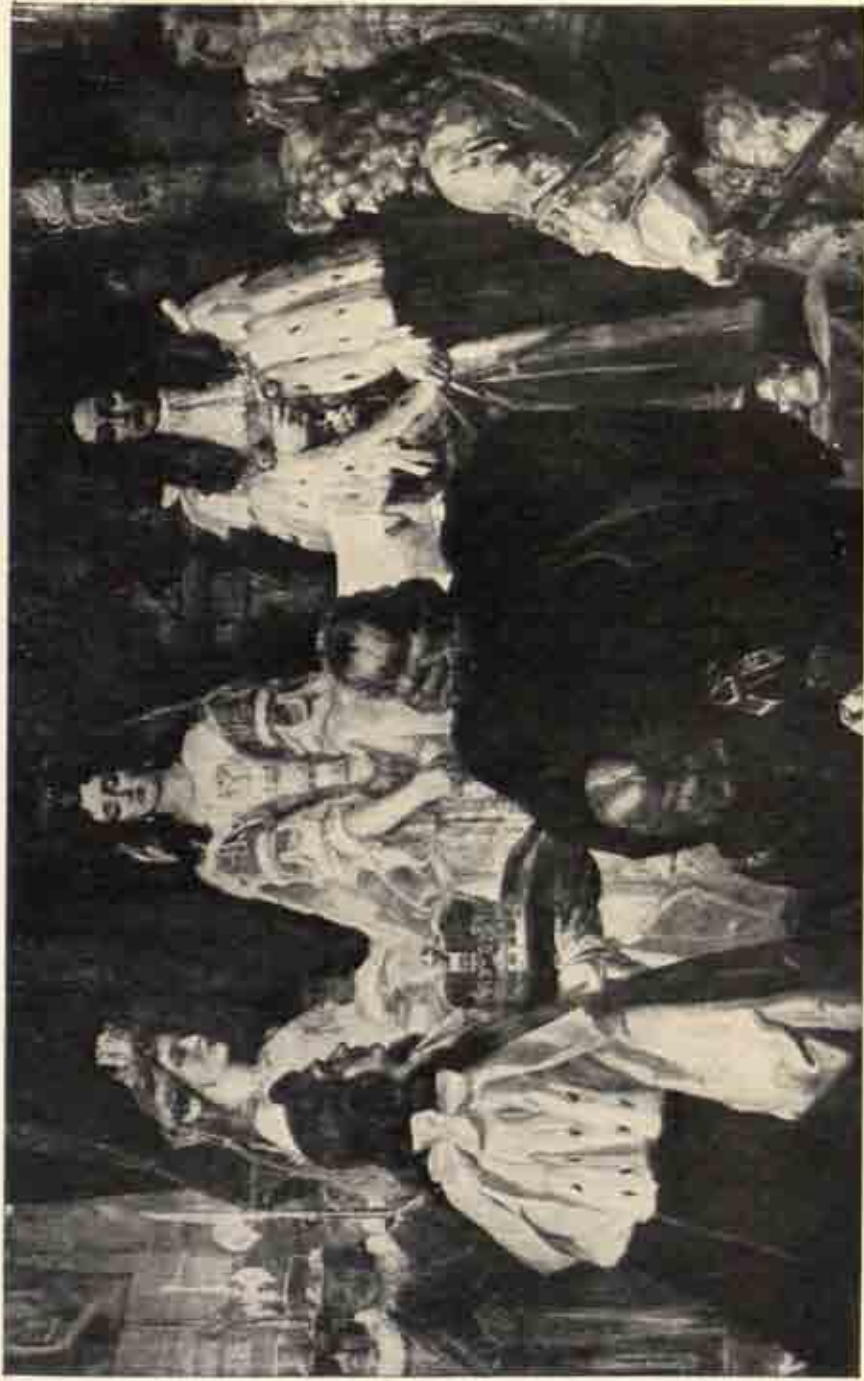
WILLIAM AND MARY RECEIVING THEIR CROWNS AT WHITEHALL. (Page 28)