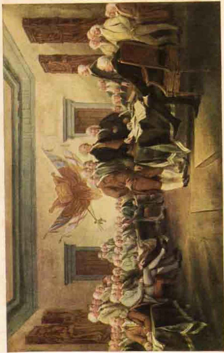
THE DECLARATION OF INDEPENDENCE (Pages 271-272)