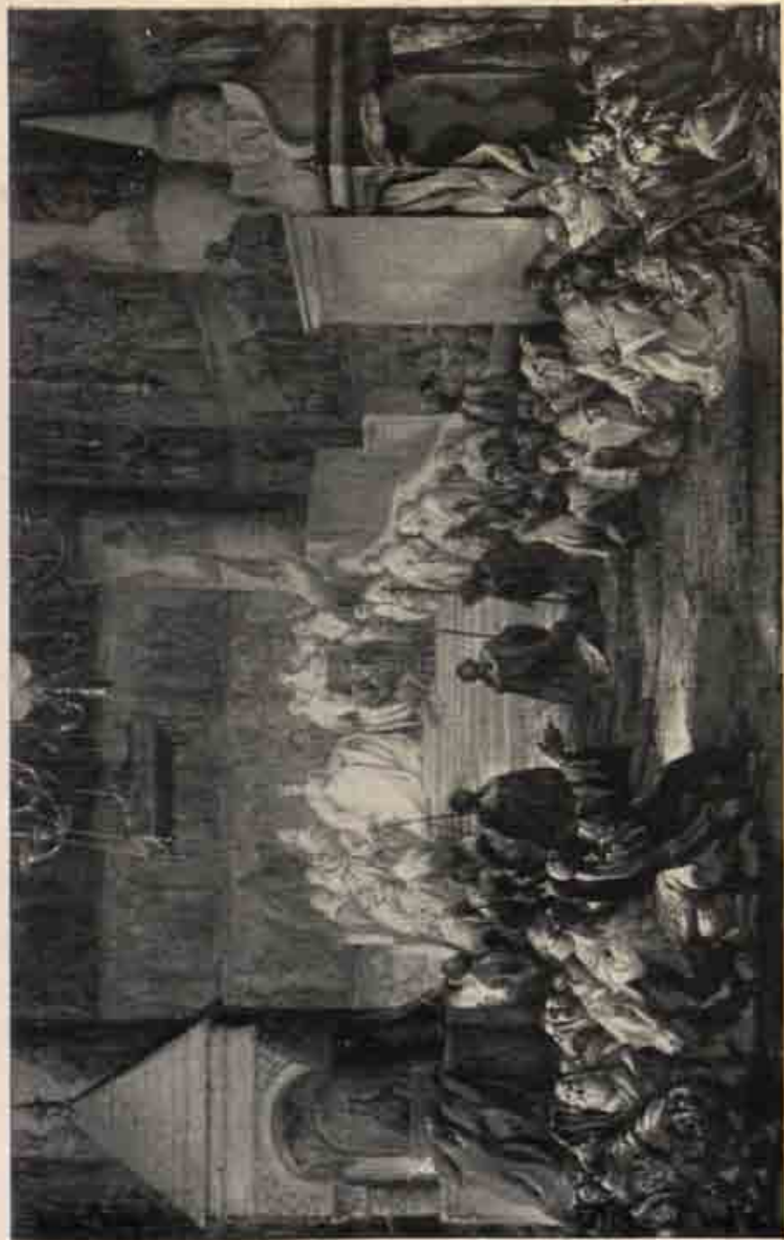
THE CORONATION OF CATHERINE II. AS EMPRESS OF RUSSIA. (Page 211). FROM THE PAINTING BY A. TORILLI