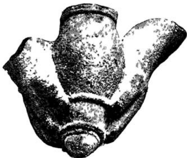
PLATE. Sculptural fragment from Nāḥ Pān, Cambodia [Reproduced from L. Finot's article, Lokeṣvara en Indo-Chine, Études Asiatiques, I, Pl. 23, fig. 6, with the kind permission of the French School of the Far East]