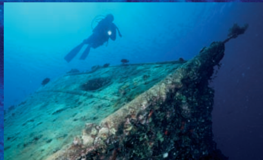
E. Trainito © UNESCO. Wreck of the Umbria , Wingate Reef, Port Sudan.

The 2001 Convention regulates that it has to be applied in conformity with other international law, including UNCLOS.