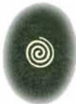
IV - Time articulation Kala-Bodha