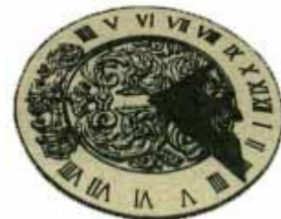
VI - Time-measure Kala-Mana