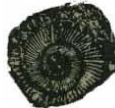
III - Breath Spandan