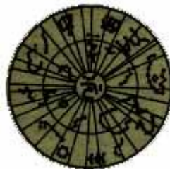
V - Space-Time DiK-Kala