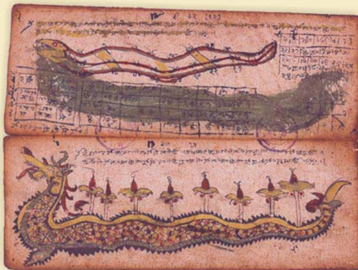
Subika, Archaic Meitei, Manipur State Archives, Manipur