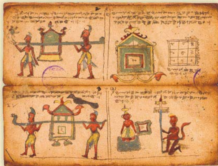
Subika, Archaic Meitei, Manipur State Archives, Manipur