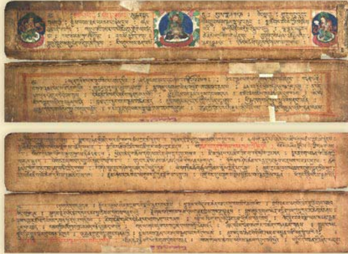
Guru padma 'byung gnas kyi skyes rabs rnam par thar pa zhes bya ba (Padma bka' thang), Tibetan, Namgyal Institute of Tibetan Studies, Gangtok, Sikkim