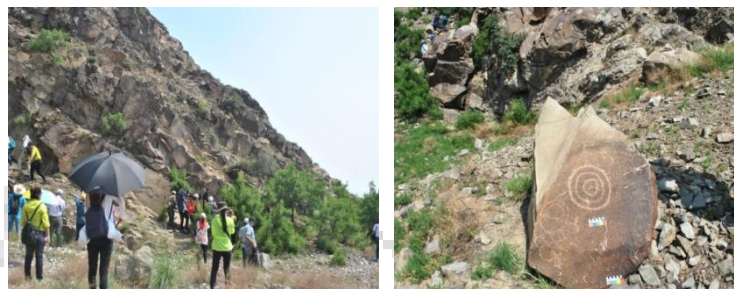
Helan Mountain rock art

famous for its inherited history and a clear evidence of this is reflected in the thousands of rock art depictions in the mountain cliffs. These depictions unveil the cultural connotations of the prehistoric life, religious worship and primitive art of the region. It is a natural concentrated museum of rock art with various themes. Human faces were depicted in different mask forms and these were referred to religious activities of particular period. Religious portraiture can be seen in form of reproductive symbols, totem worship, hand prints etc. Many other depictions like humans engaged in various activities including hunting and dancing, grazing of animals are also seen in the area. While recognising the importance of the Helan Mountain rock art it was listed in the National Key Protective Historical Relics by the State Council in 1996.