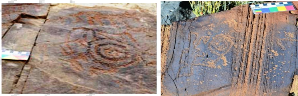
Engravings of concentric circles and animal figures at Huangya Gou (L) and Spiti, Himachal Pradesh(R).

Archaeologically speaking, Kashmir had a highly developed Neolithic culture spread throughout the length and breadth of the valley. The investigations in high altitude Ladakh for last couple of decades have brought to light a large number of petroglyphs from different areas mostly confining to the ancient routes and passes connecting two valleys in Ladakh and also connecting Ladakh with surrounding areas particularly Central Asia. It is interesting to note that in Nubra valley the ancient route to Karakoram and further beyond to China lies on the left bank of river Nubra near village Sasoma. This evidence not only establishes the early human contact with neighbouring areas, but also establishes human movement within the valley. Rock art of Himalayas and Tibetan plateau and its adjacent areas in China have definite connections. That is why we find universality of content and style in the rock art of Heishan, Jingtai and of other places of China and rock art of India, especially from the Himalayan region (Ladakh, Spiti etc).