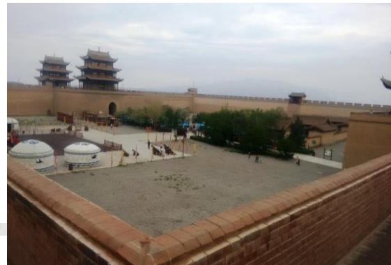
General view of Jiayuguan pass

On 23 rd July, 2017 afternoon we landed in Lanzhou, the capital of Gansu province. We were the guests of the Northwest Normal University at Lanzhou. Credited as “the Cradle of Teachers Education in Western China”, Northwest Normal University (NWNNU) is a major university under the joint administration of the People’s Government of Gansu Province and the Ministry of Education of China. It is also one of the 14 state-supported universities in Western China.