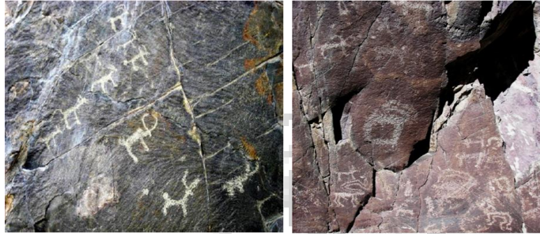
Group of animal engravings at Shiguan Narrow (L) and Likitse, Ladakh (R).

both sides of the valley. The images are vividly depicted with rough, strong lines. It contains animals and people. Jingtai county is located in the eastern end of the Hexi Corridor, Gansu province hinterland North area, southern margin of Tengger Desert. It lies in the east of the Yellow River and Jingyuan county, Pingchuan District across the river. More than 100 pictures have been reported so far from the area. These pictures are rich in content and style; bold and abstract patterns display the author's imagination, have the original strong colour and give us a kind of mystery.