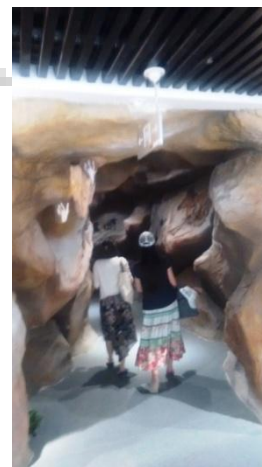
Multimedia display at the Museum