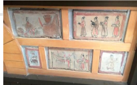
Paintings of Wei and Jin Dynasties on tiles at Wei-Jin Art Gallery (Interpretation Centre of Under Ground Gallery)

On 21 st July, 2017 a visit to Under Ground Gallery – Wei Jin Brick Mural Tomb of Han and Jin Dynasty was made. Located about 18 kilometres northeast of Jiayuguan, Wei-Jin Brick Mural Tomb is a big tomb group with over 1,400 tombs built between the 3 rd to 5 th centuries during the Wei and Jin dynasties. Renowned as the largest subterranean art gallery in the world, it reflects the political, cultural, military, and scientific