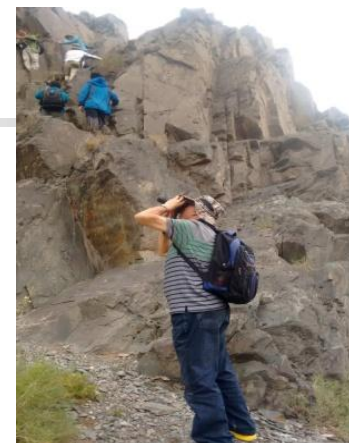
Delegates on field investigations