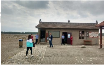
A view of Wei-Jin Brick Mural Tomb (Under Ground Gallery)

Shiguanxia (pass) and Muozigou sites was made. These two sites are very significant in the Heishan Rock Art of Gansu province.