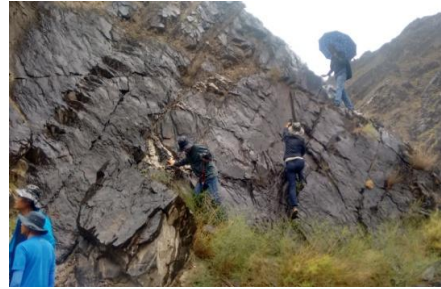
Field trip to Black Mountain Montenegro.

On 19/07/2017 afternoon, we had a field trip to Black Mountain Montenegro rock paintings called "Montenegro cliff shallow stone carving", located in the northwest of Jiayuguan about 10-20km of the Montenegro Canyon steep diffs, is believed to be a real life record of nomadic production area of Montenegro in ancient times. Contents depicted are hunting, riding and shooting practice, dance and other