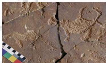
Yak figures from, Rutok, Upper Tibet

The art of even later periods of both the countries have witnessed the interchange of thought currents and artistic exchanges. For example, Dazu has the glimpses of ancient cultural undercurrent between India and China. The rock art of western Indian Buddhist caves and the sculptural and painted art traditions of India inspired the rock art of China at many sites including the grottoes at 70 sites in Chongqing's Dazu County forming a large ritual site of Tantric or mystic Buddhism. The amazing grottoes and painted sculptures of Avalokitesvara, Amitabha, Manjusri,