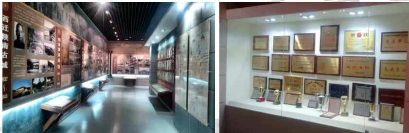
Displays showing history of University at Northwest Normal University Museum

In the afternoon of 24 th July, 2017 a visit to the University Museum was undertaken. The ground floor of the museum displays the history of the university. The other floors of the museum display the evolution of earth, human being, geomorphology, flora