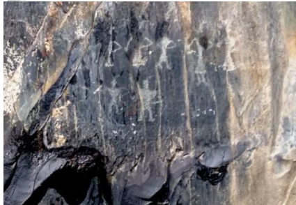
Depiction of dancing figures on rock surface at Black Mountain Montenegro.

scenes as well as many in sheep, cattle, deer, dogs, camels, birds, chickens, fish and other animal images. Montenegro rock painting is the unique cultural heritage and cultural landscape of the city. It occupies an important position in the world of rock paintings, whose long history, profound connotation, exquisite art is amazing.