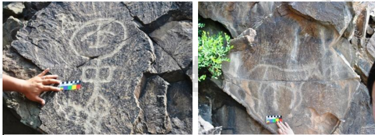
Engravings at Gao Fu Pass of Helan Mountain

On 17/08/2017, the delegates were taken to a rock art site- Gao Fu Pass of Helan Mountain. The Helan Mountain stretches 250km from the south to north, blocking the Tengery desert as a natural barrier and known to be an oasis of the hinder land. Since ancient times, this region was