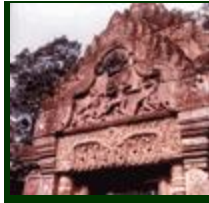
Vali Vadh, Bentey Srei Temple, Cambodia