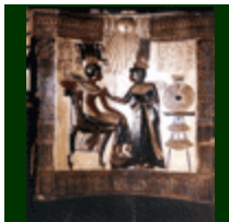
Egyptian Plague, Salarjung Museum, Hyderabad