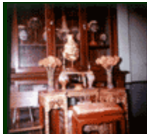
Mask for Bharata School of Dramatic Arts, Thailand