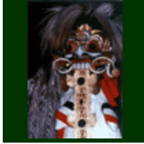
Mask of Rangda, Indonesia

a painter who has evolved a unique style of her own to depict dance movement on the canvas. In the Television News Bulletin in the USA she was featured as a rare artist who can present dance both as a performing as well as a visual art.