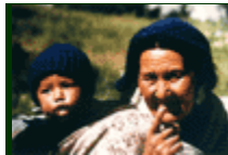
Mother & Child, Ladakh