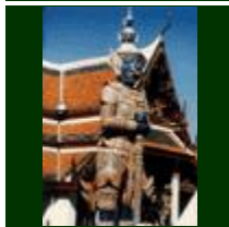
Dwarpalka, Emerald Buddha Temple, Bangkok