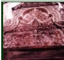
Gaja Lakshmi, Bentey Srei Temple, Cambodia