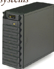
Removal of Data from vendors systems