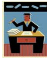
Document Preparation by Scholars / subject experts for Scanning