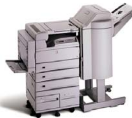
Printouts of DVD Jacket Cover & DVD Labels