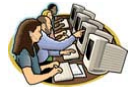
Basic Quality Check of Images