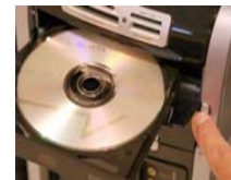
Final DVD Creation of Scanned & Cleaned Material