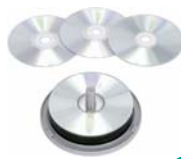
Delivery of Data on DVDs & Porting data on client's Server with proper indexing