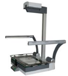
Scanning of Material