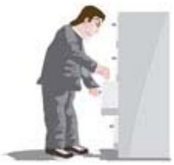
Site Survey And infrastructure deployment