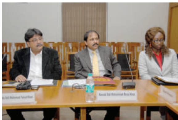
Participants at the seminar on 'Africans in India: A Rediscovery'

Coinciding with the exhibition, a one day conference was hosted by IGNCA on 'Africans in India: A Rediscovery' on October 15, 2014. Several scholars from India and a few from abroad participated in the conference. Around 12 papers were presented, focusing on the ancient link between the African and Indian communities, the contribution of the African community in India in the field of art, architecture, military skills, and religion. Since a majority of the African communities came from East Africa, which falls along the Indian Ocean, the subject is of significant interest under ' Project Mausam ' recently launched by the Ministry of Culture.