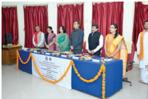
Inauguration of the seminar- 'Indian Arts enshrined in textual traditions: with special reference to Gujarat' at the M. S. University, Vadodara

In 2014, a series of seminars was initiated by the Kalakosa Division, in which subject experts of a particular region were invited to present their papers on such texts of Indian arts which have played a pivotal role in the preservation and propagation of some specific art-form. These seminars help IGNCA in identifying new and young scholars in various streams as also to network with like-minded organisations/universities. The Seminar at Gujarat addressed itself to various aspects of the textual wealth of Gujarat along with traditional art forms, which constitute an integral part of the Indian artistic heritage.