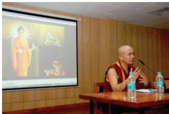
National seminar on 'Thoughts of Gandhi and His Holiness Dalai Lama'

A national seminar was held on 'The Thoughts and Contributions of Mahatma Gandhi and His Holiness the Dalai Lama' by Tibet House (Cultural Centre of His Holiness the Dalai Lama) in collaboration with IGNCA on March 28-29, 2015.