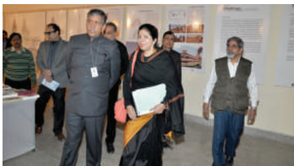
'Sanskriti Festival' at Varanasi

In December, IGNCA participated in the Cultural Festival on Sanskriti in collaboration with the Sangeet Natak Akademi, Sahitya Akademi and Lalit Kala Akademi at the Faculty of Visual Arts, B.H.U. from December 25-27, 2014. On this occasion, an impressive exhibition was organised. (1) A display-cum-sales counter of IGNCA publications was set up, (2) an exhibition on the Brhadiswara Temple, Thanjavur was organised and (3) 9 Documentary Films were screened. Member Secretary also attended the event.