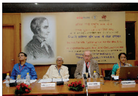
Participants in 'Buddhist Transcreations in Tibetan Literature and Art'