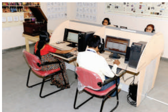
Digital listening archive of vintage music: Audio Visual archival centre of IGNCA, Southern Regional Centre