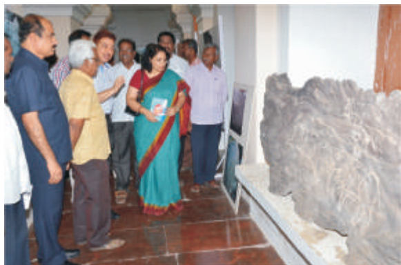
A visit to the rock art exhibition at Thanjavur, Tamil Nadu