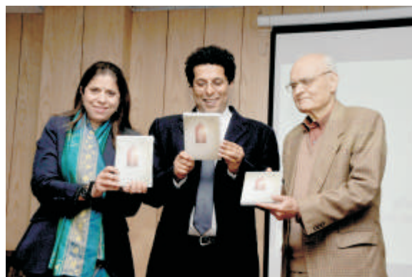
Release of the DVD, 'Rupa Pratirupa: the Body in Indian Art'