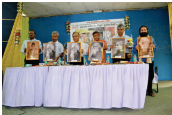
Exhibition-'Gurudev Rabindranath Tagore- A Visionary, Artist and Poet' at Women's College, Silchar, Assam