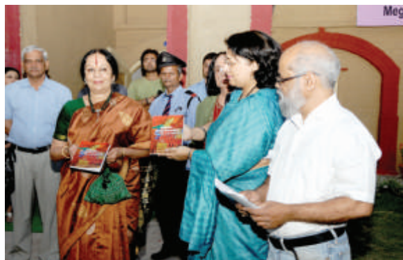
Release of the catalogue on 'Nirbhaya-Multiple expressions'

A contemporary art exhibition, 'Nirbhaya-Multiple Expressions' was organised at IGNCA in collaboration with Creative Mind Publications. The exhibition presented the works of 100 artists on the theme of women's safety and sensitivity. The exhibition later travelled to Niv Art Centre, New Delhi where it remained open from April 26, 2014-May 3, 2014. A day-long art camp was organised on April 6, 2014.