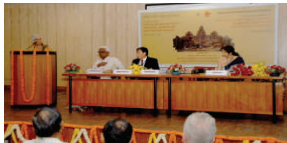
International Conference on the 'Cham Heritage of Vietnam: Ecological, Cultural and Art Historical Traditions'