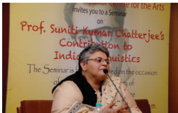
Seminar on '125th Birth Anniversary of Prof. Suniti Kumar Chatterjee'