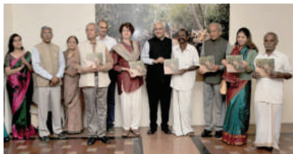
Release of the catalogue on 'From Earth to Earth: Devotion and Terracotta Offerings in Tamil Nadu'.

Artisans presented live demonstrations of the processes involved in the making of terracotta horses from Tamil Nadu.