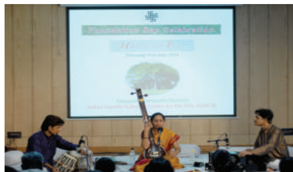
Celebration of 'Hariyali Teej'