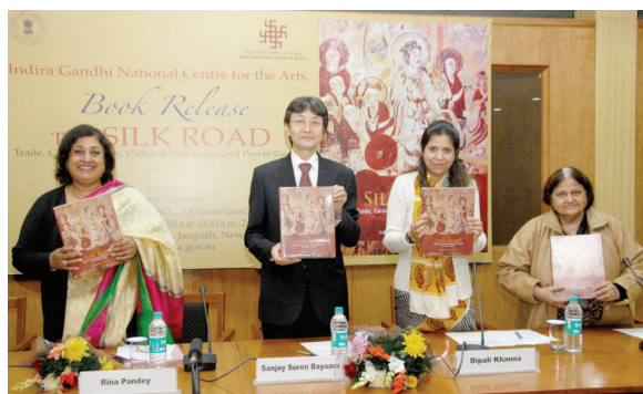
Book Release- 'The Silk Road-Trade, Caravan Sarais, Cultural Exchanges and Power Games'