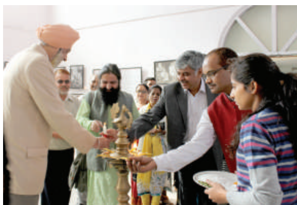
Inaugural ceremony of the exhibition- 'Gurudev Rabindranath Tagore- A Visionary, Artist and Poet' at Kurukshetra University, Kurukshetra