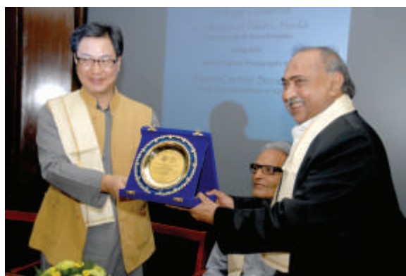
Inauguration of the exhibition on 'The Vintage Camera Collection' by Shri Kiren Rijiju Hon'ble Minister of State for Home)