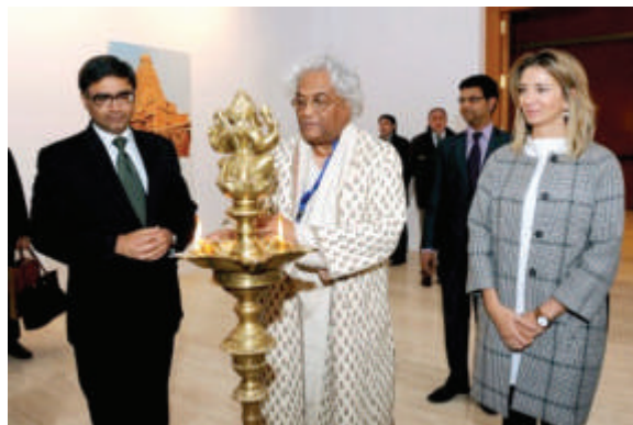
Inauguration of the exhibition-'Brhadiswara: The Monument and the Living Tradition' at Valladolid, Spain

The exhibition titled 'Brhadiswara: The Monument and the Living Tradition', depicting various aspects of the temple, was put on display at Bengaluru (June 13–22, 2014), Valladolid, Spain (November 13 to December 13, 2014), Coimbatore (November 15–23, 2014), Varanasi (December 25–29, 2014 and