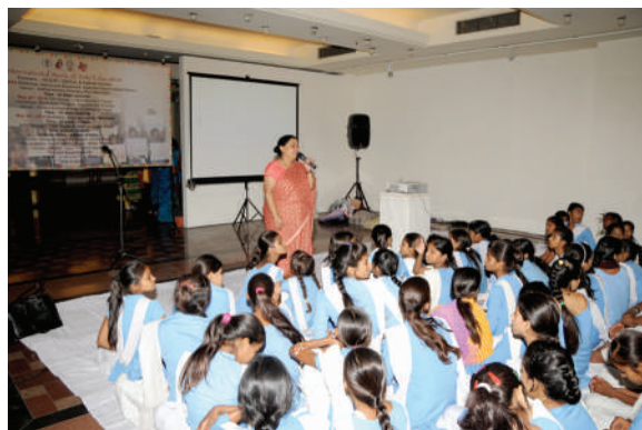
'International Week of Art Education' in collaboration with NCERT