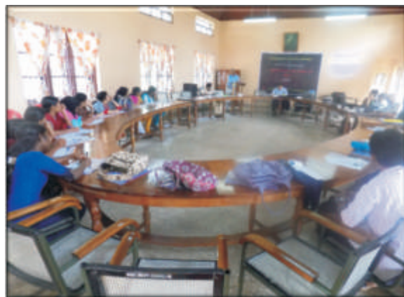
Orientation Workshop at Union Christian College, Thirpunnithara, Aluva, Kerala