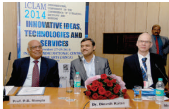
The team from CIL also participated in 'ICLAM conference'

Director (CIL) presented papers on 'Role of Multi-Media in Propagation of Culture' on September 26, 2014 and 'Use of Digital Technology in understanding the ethos of Indian Arts' on November 7, 2014 at CCRT, New Delhi.