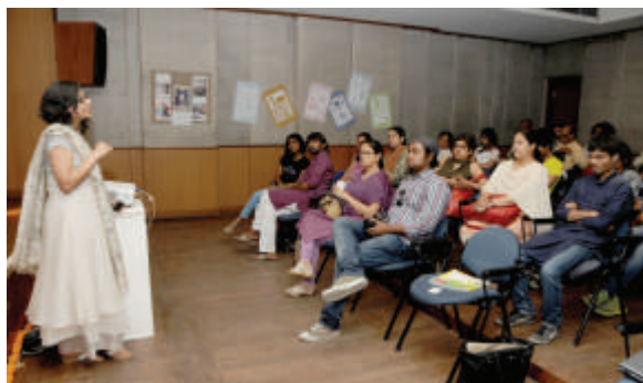
Seminar on 'Integrating Visual Literacy in the Classroom'

experience on the Artist-Mentor programme. Their works were also put up on display till May 3, 2014.