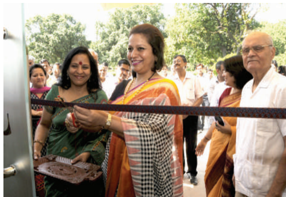
Inauguration of the 'Svasti-The IGNCA' Shop

sells handicrafts items from different regions of India; DVDs and publications of IGNCA.