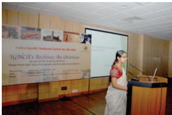
Seminar on 'IGNCA's Archives: An Overview'