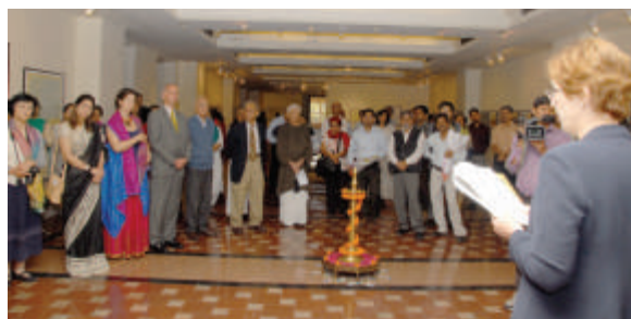
Inauguration of the exhibition, 'Fascinated by the Orient, Life and Works of Sir Aurel Stein'

An exhibition 'Fascinated by the Orient - Life and Works of Sir Aurel Stein' was hosted coinciding with the conference. The exhibition, drawn largely