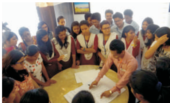
Workshops on 'Conservation of Books' and other 'art Objects' at Assam