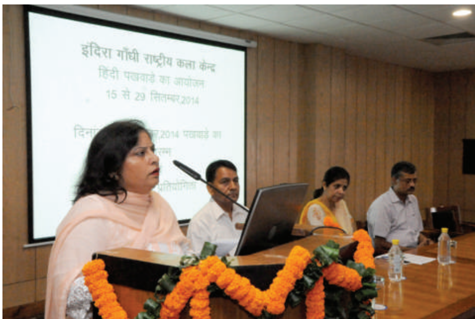
‘Hindi Pakhwada’ at IGNCA

Sutradhara functions as a facilitating mechanism so that IGNCA can adequately meet its objectives as set out in its Deed of Declaration. Sutradhara is responsible for administrative and financial support to all the Divisions in their activities. Project proposals received from the Divisions are examined by this Unit to ensure that they conform to the guidelines laid down. It also coordinates with the Ministry of Culture with regard to financial grants and implementation of the Ministry's directions.