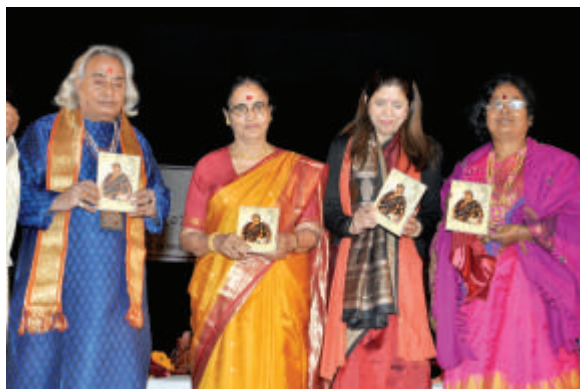
Release of the Music DVD on 'Dr. N. Rajam' at Varanasi

IGNCA has recorded the compositions of 25 great masters under the series 'Masters of Hindustani Classical Music'. In an effort to widely disseminate this rich resource of India's cultural heritage, select parts of the recordings on musicians were released in DVD format. Each DVD set carries a booklet, authored by a musicologist or music critic; a short introduction of the artist and his or her genre of music.