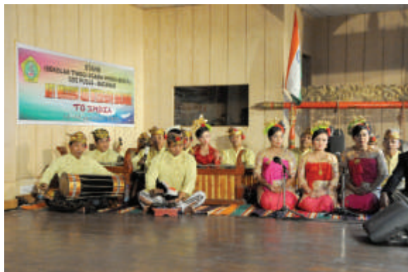
A group of artists from Sekolah Tinggi Agama Hindu Negeri , Gde Pudja Mataram, Indonesia