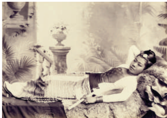
'Burmese Lady', A photograph from the exhibition-'Drawn from Light: Early Photography and the Indian Sub-continent'

open till September 30, 2014. Curator walks, lectures, a photography workshop and a seminar were part of the event.