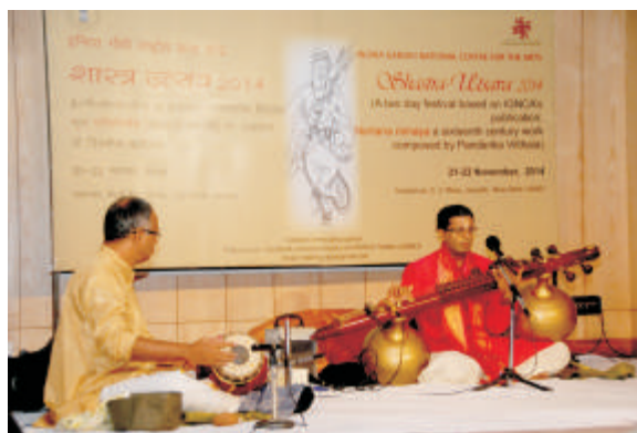
Concert at the 'Shastra Utsav : 2014'

A two-day event, Shastra Utsav was hosted by IGNCA on November 21-22, 2014. The IGNCA publication 'Nartana Nirvana of Pandarika Vitthala' under the KMS Series was chosen for analysis and for writing a dissertation under this programme this year.