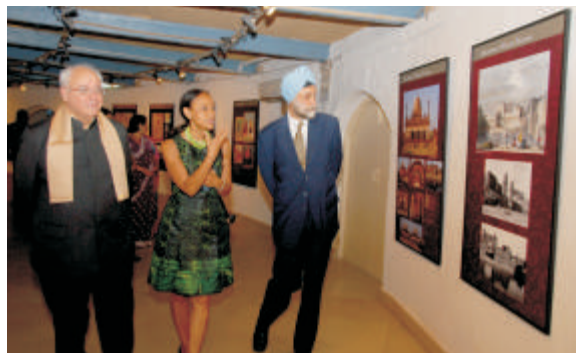
Inauguration of the exhibition, 'Africans in India: A Rediscovery'