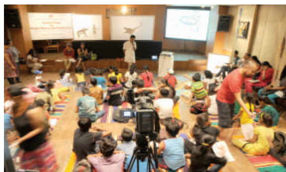
Summer camp on 'Puppet making and performance'