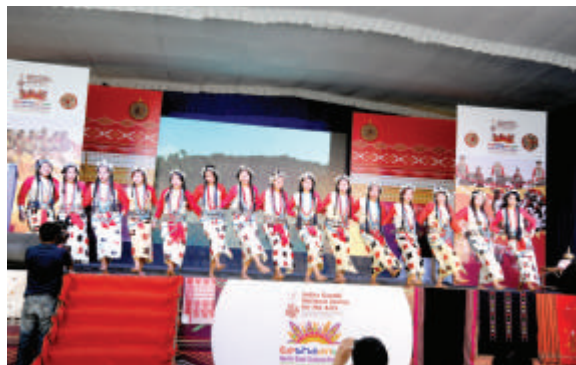
Rikham Pada Dance of Arunachal Pradesh at 'EESHANYA-North East Cultural Festival'

discussion on 'Connecting North East with the rest of the Country-Challenges and Opportunities'. An exhibition on 'Basketry' was also organised as part of the event and film screenings were held that captivated the audience.