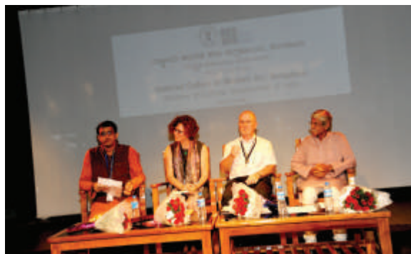
Seminar on 'Transformative Music and Music Education: Perspectives from Research, Policy and Practice'

Several interesting issues were discussed over three days related to the eco-system of musical pedagogy in India; social outreach efforts and their impact; role of music in addressing concerns of children with special needs and enhancement of cognitive development; use of technology for music education etc. Working groups were created to discuss strategies towards approaching government bodies for inclusion of music education in school curriculum .