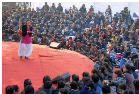
The performer from U.K. sharing tales with school students during 'Kathakar-International Storytellers Festival'