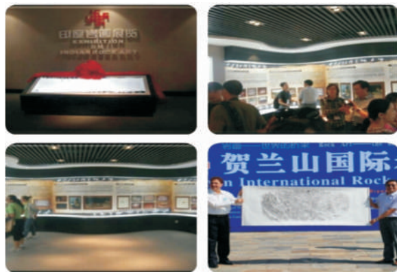
Exhibition on Indian Rock Art held at 'The World of Rock Art Museum', Yinchuan, China

Yinchuan, China (August 26, 2014 – September 30, 2015), (ii) A four member IGNCA delegation participated in the '2014 Chinese Helanshan International Rock Art Summit Forum' at the Provincial Headquarters of Yinchuan (August 26-28, 2014).