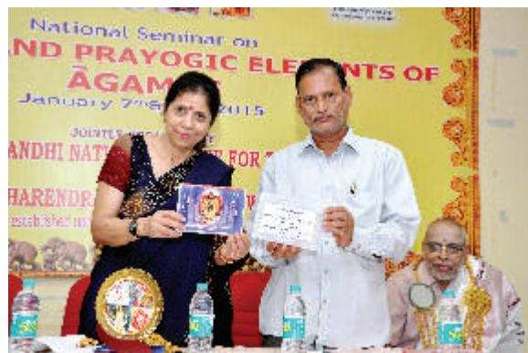
Felicitations at National Seminar on 'Shastric and Prayogic Elements of Agamas' at Kanchipuram, Tamil Nadu

Along with this concept, issues relating to the Agamic texts for understanding the cultural and artistic rules, conventions, practices and