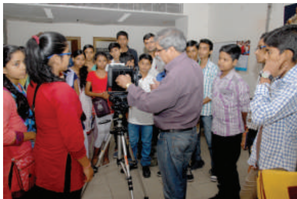
Workshop on 'Photography'

of the exhibition, 'Drawn from Light: Early Photography and the Indian Sub-Continent', the workshop was conducted by Shri D.N. V. S. Seetharamaiah, Senior Photography Officer from IGNCA. Participants from different schools attended the workshop.