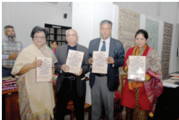
Release of the catalogue on the 'Kantha' exhibition

Crafts demonstration by Kantha artisans from West Bengal was also organised as part of the exhibition.