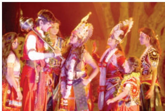
Performance- 'Ram ki Shakti Puja'