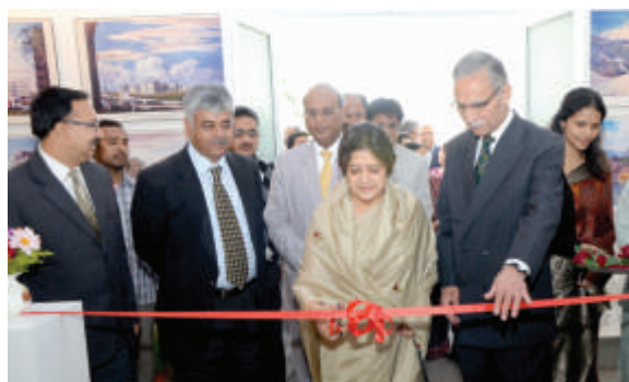
Inauguration of the exhibition 'Images of India- A Fascinating Journey through time' at Aligarh Muslim University