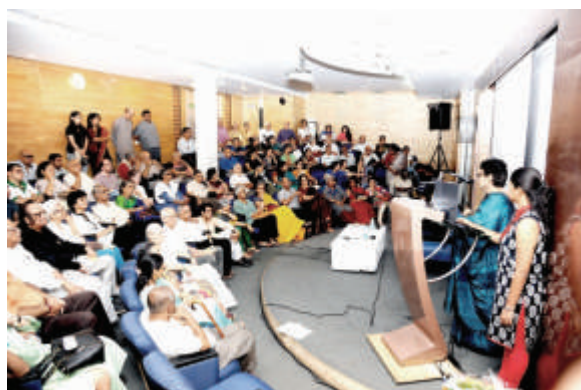
South India Heritage Lecture series – 'The Talking Rocks of Badami-Rock cut sculptures of Badami caves'