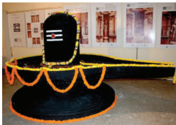
Brhadiswara: The Monument and the Living Tradition at Varanasi

January 1–31, 2015) and Chennai (January 19–24, 2015).