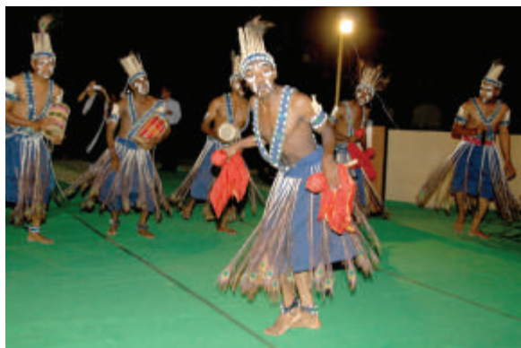
Performance of Sidi Goma Troupe during the exhibition- 'Africans in India: A Rediscovery'

A performance by the 'Sidi Goma troupe' (The Black Sufis of Gujarat) was also organised during the opening, showcasing the cultural traditions of Africans in India. A number of senior government officials and the diplomatic fraternity visited the exhibition.