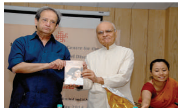
Release of the book on Dr. Rashid Jahan- 'A Rebel and her Cause: Life and Work of Rashid Jahan'