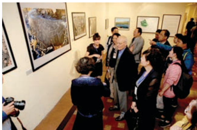
India China Rock Art Exhibition at IGNCA, New Delhi

Report on India-China Rock Art Workshop held at IGNCA from 24-26 February 2016.