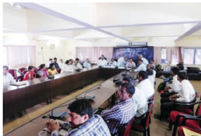
Public dialogue-cum-awareness workshop at Robertsganj, Uttar Pradesh