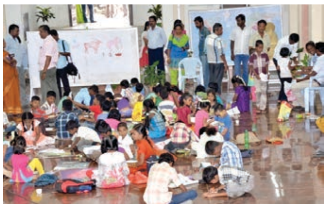
Children workshop at Thanjavur, Tamil Nadu