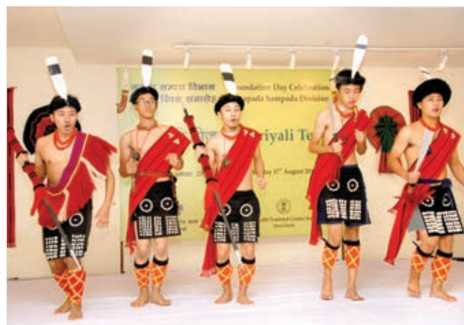
Dance of Lotha Nagas - Celebration of Foundation Day of Janapada Sampada Division on the occasion of Hariyali Teej