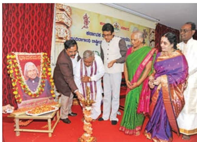
Inauguration of Kuchipudi Dance workshop and performance