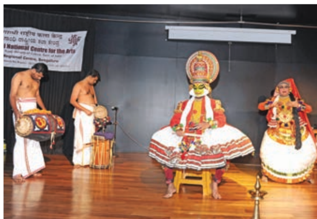
Workshop on Kathakali

association with Bharatiya Vidya Bhavan on 20 June 2015. The performance was accompanied a background power point presentation to facilitate thorough understanding of the performance executed through gestures and songs.