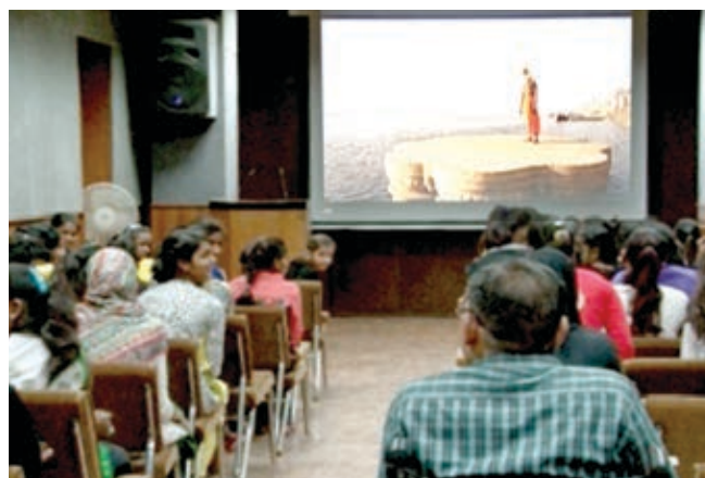
Film screening at Media Centre

Media Centre has been regularly screening films from IGNCA's own collection as well as from PSBT on the second and fourth Friday of every month. Most of the films are followed by interactive sessions between the director and the audience.