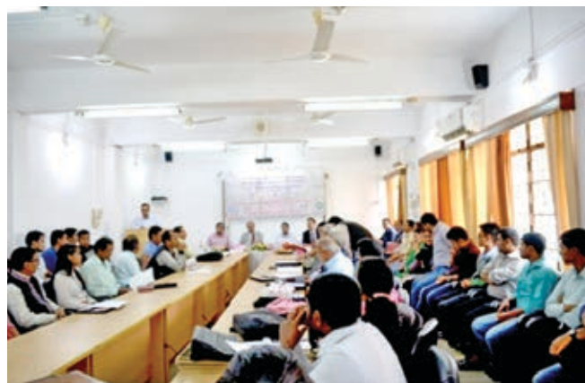
Inaugural session of the National seminar on Prehistory and Ethno-archaeological Background of Rock Art with Emphasis on Assam and Adjoining States at Tripura, Agartala