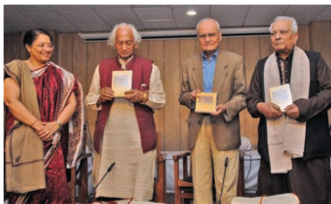
DVD Release on Late Ustad Faiyaz Khan