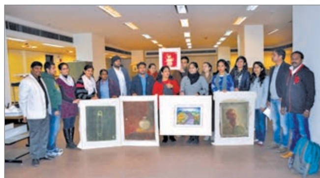
Participants during the lining workshop at IGNCA

Five lining methods were explained and demonstrated to the participants i.e. Glue- Paste lining, Wax-Resin lining, Beva lining on canvas, Beva lining on high density polyester cloth and Mist lining. Participants also learnt the ethics of lining, the methodology and application of each lining method along with different lining practices