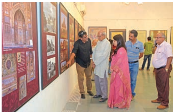
Inauguration of exhibition, Africans in India: A Rediscovery at Vadodara