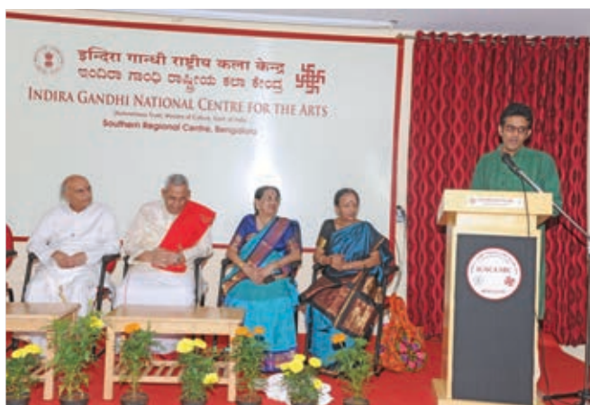
Inauguration of Seminar on AMS easy method