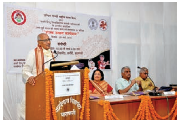
Shastra Utsava on Performative Traditions of North East India at Varanasi