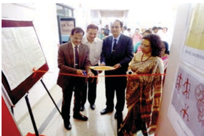
Inauguration of 'The World of Rock Art Exhibition' at Nagpur