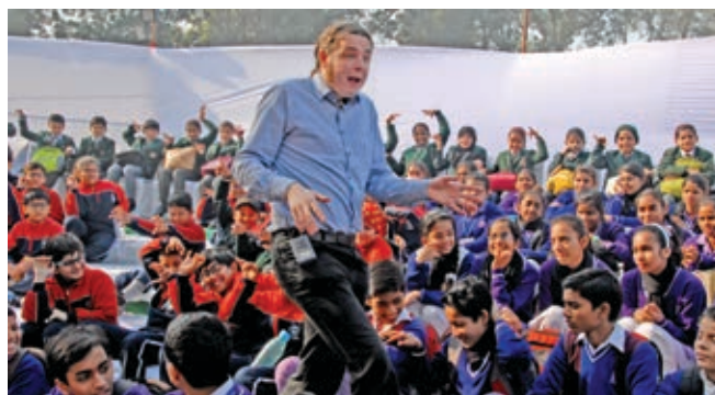
Students from various schools of Delhi at Kathakar: International Storytellers Festival