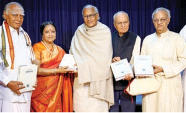
Book Release of Natyasastra Volume I at Chennai