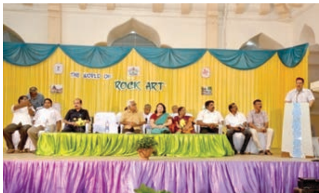
Inaugural function of 'The World of Rock Art Exhibition' at Thanjavur, Tamil Nadu