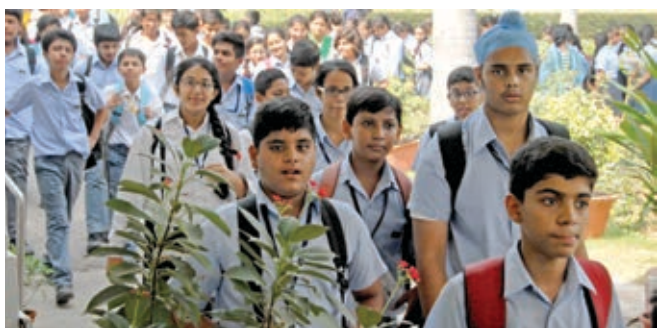
Students from various schools of Delhi visit Screening of Shri Ramlila, Ramnagar, Varanasi