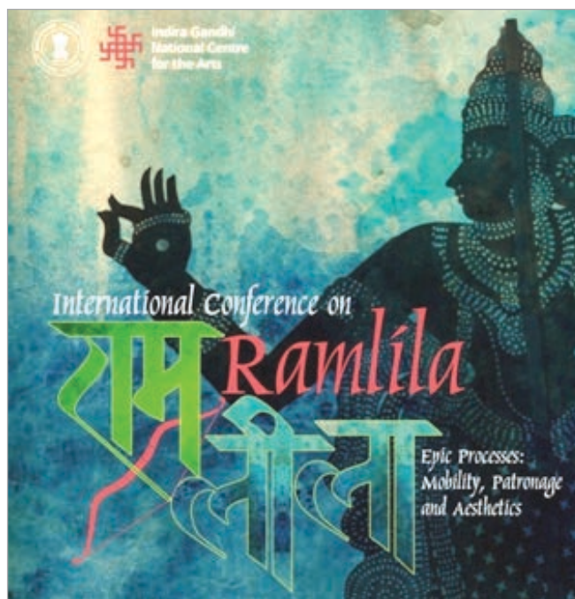
Poster of Ramlila

International Conference on Ramlila: Epic Processes: Mobility, Patronage and Aesthetics - 23-29 November 2015