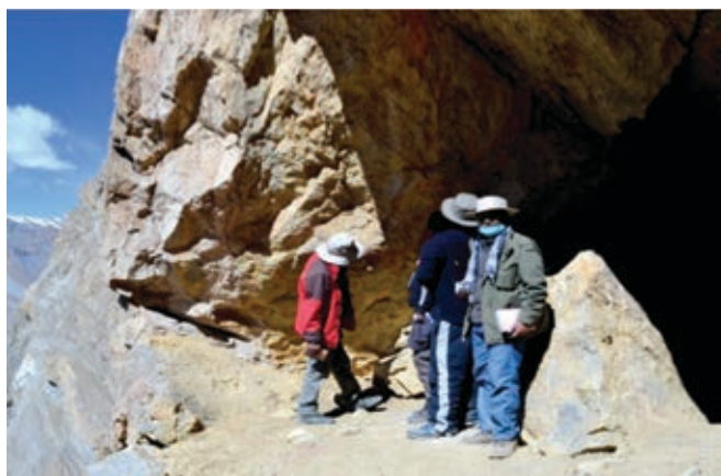
Field work at Spiti district, Himachal Pradesh