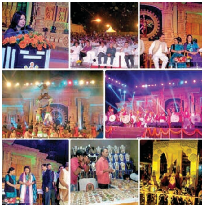
Rashtriya Sanskriti Mahotsav, Ministry of Culture at IGNCA