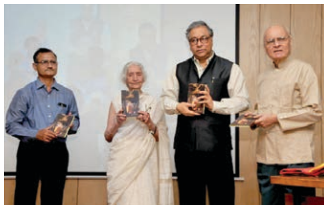
Release of Multimedia Presentation on Gita Govinda

challenge was to ensure the permeation of this text to different parts of India.