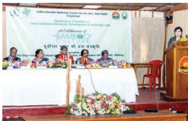
National symposium cum workshop on Significance of Bamboo at Shillong