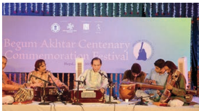
Begum Akhtar Centenary Commemoration Festival at Bhopal

the Bhatkhande Sangeet Vishwavidyalaya and U.P. Sangeet Natak Akademi, Lucknow from 1-15 October 2015.