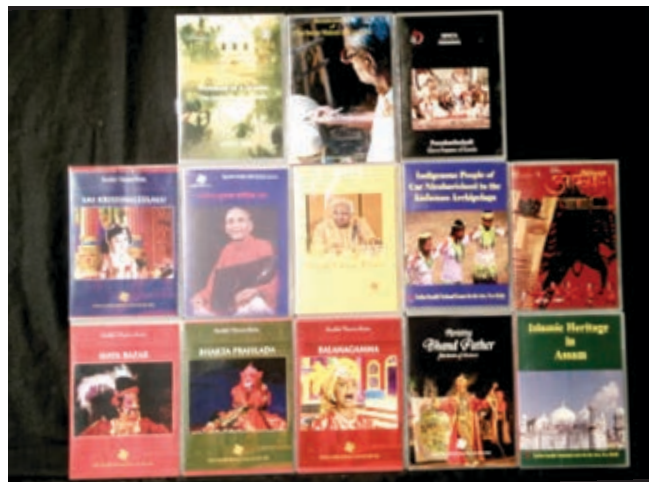
Major DVD publication during 2015- 16