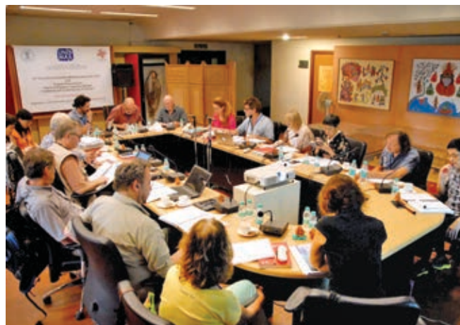
UNIMA Seminar at IGNCA

A seminar was organised on World of Puppets: Legends, Ballads, Traditions and Contemporary Practices in collaboration with UNIMA (Union Internationale de la Marionnette) from 10-14 September 2015.