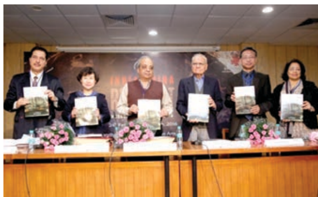
Book Release during the India-China Rock Art Workshop cum Exhibition