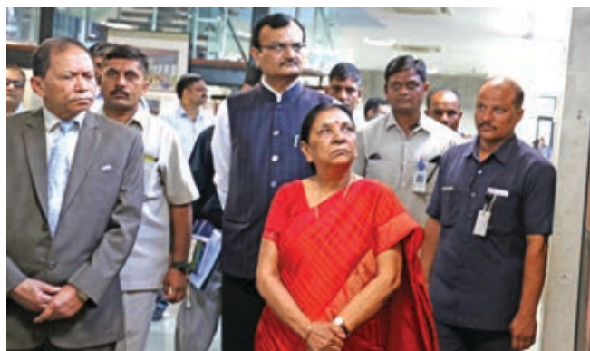
Smt. Anandiben Patel, Hon'ble Chief Minister of Gujarat visits exhibition, Africans in India at Gandhinagar

The next destination for the show was the Gujarat National Law University, Gandhinagar on 10 August 2015. It was inaugurated by Dr. S.K. Nanda (IAS) and Nawab of Sachin, Shri H.H. Sidi Mohammed Reza (one of the descendants of the royal family of Africans in India). Here the exhibition was on display till 15 October and was visited by several dignitaries including the Chief Minister of Gujarat, Smt. Anandiben Patel.