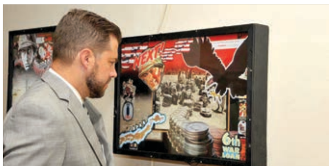
A visitor at the exhibition, Following the Box : An artist exploration of an archive of anonymous photographs from India