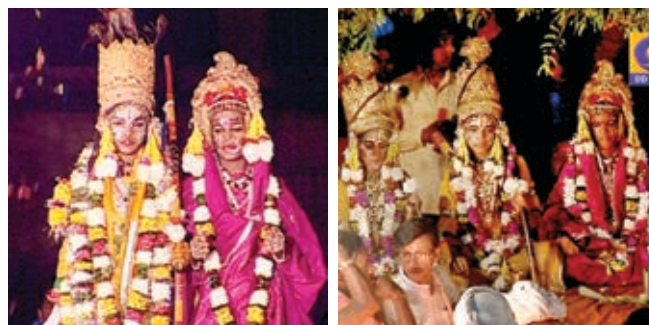
Telecast of Shri Ramlila, Ramnagar, Varanasi on DD Bharati