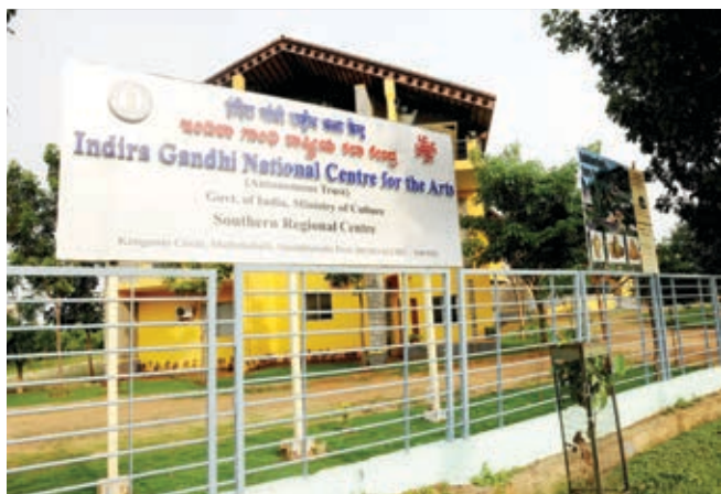
Campus of Southern Regional Centre, Bengaluru