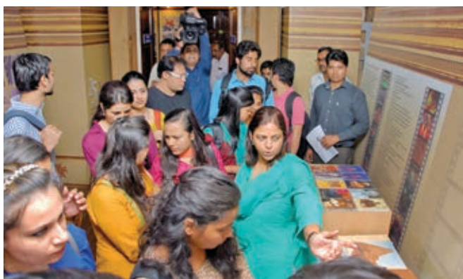
Students from Delhi University visit IGNCA

like puppet shows, art workshops, music workshops, film festivals, cultural performances and story-telling sessions are organised for school children and graduate students either within IGNCA or in schools and colleges. Kaladarsana invites and hosts students from schools and colleges for various events that are held at IGNCA.