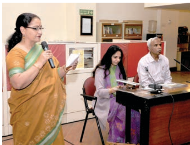
Book Reading Session at IGNCA Library

The Book circle of the Library hosts book reading sessions on every fourth Thursday of the month. Eminent authors are invited to read from their recent books. The purpose of this programme is to attract more readers to the library.