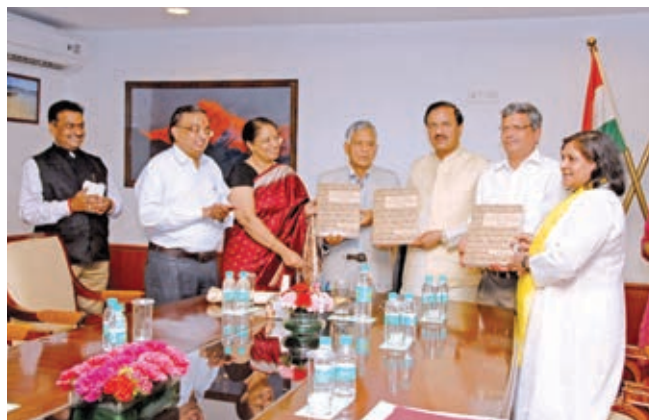
Book Release of The Culture Heritage of Trans-Himalaya (Kinnaur) by Hon'ble Minister of Culture, Dr. Mahesh Sharma