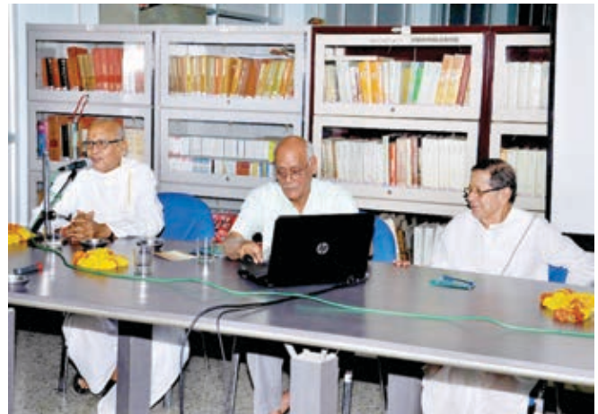
Celebration of Foundation Day of Eastern Regional Centre, Varanasi