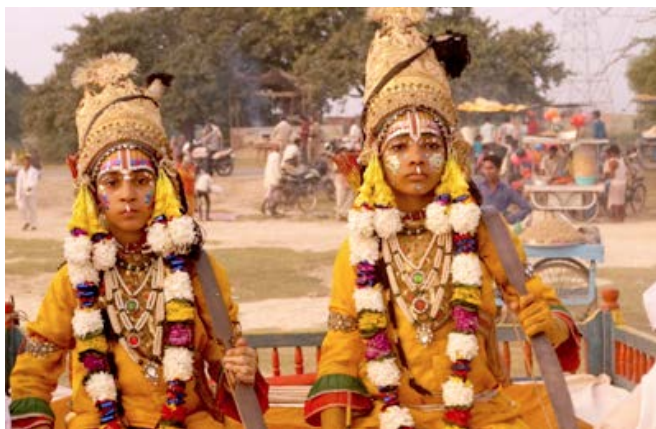
Film Show-Shri Ramlila, Ramnagar, Varanasi at IGNCA's Media Centre