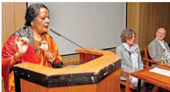
Dr. Sonal Mansingh, eminent Danseuse at the Seminar on Translation Research in Music & Music Education: Transforming Individuals & Communities

sessions to discuss how music education could be used to for better development of individuals, especially children with different abilities. Participants from abroad shared the research findings in the field.