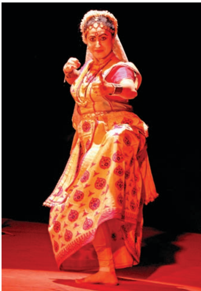
Sattriya dance performance during Shastra Utsava