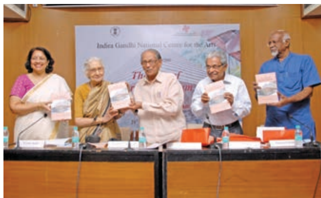
Book Release of The Arts of Kerala Kshetram at IGNCA