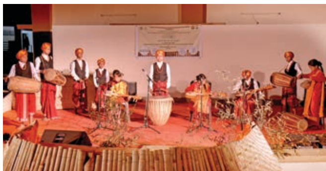
Cultural performance during National symposium and workshop on Significance of Bamboo