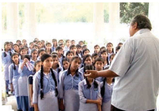
Children workshop at Media Centre

Media Centre organised special screenings of, Shri Ramlila, Ramnagar, Varanasi for schools, wherein students from various schools (both government and private) sent their students to see and