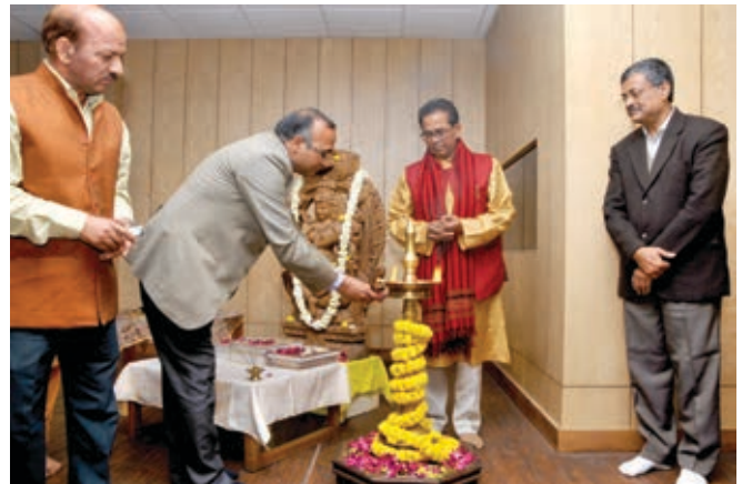
Celebration of Foundation Day of Kalanidhi Division on the occasion of Basant Panchmi

images. The unit offers a rich resource for research and reference. (d) Kalanidhi has a cultural archive containing audio visual material, photographs, artefacts, and personal collections of art historians and scholars in the form of diaries, correspondence etc.