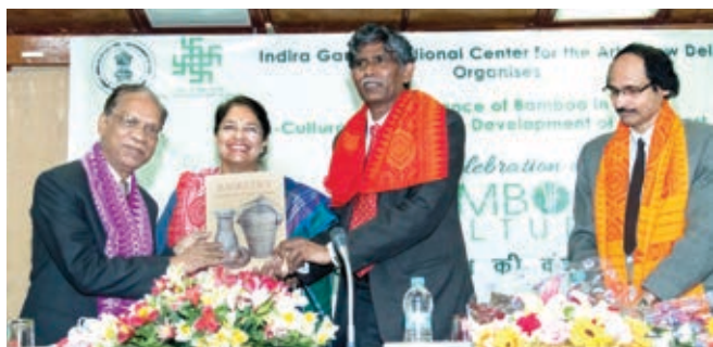
Book Release of Basketry catalogue during the National Symposium