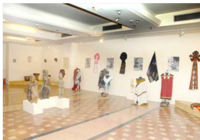
A view of the Exhibition - Celebrating Creativity of North East India

Annual Day Celebration of Janapada Sampada was held on 17 August 2015 at IGNCA