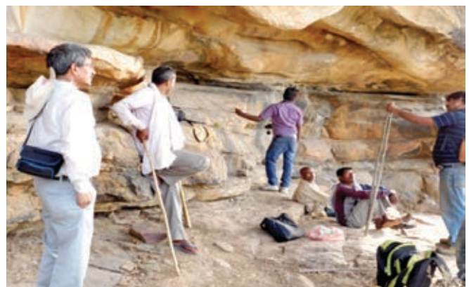
Field work at Sonbhadra and Robertsganj district, Uttar Pradesh