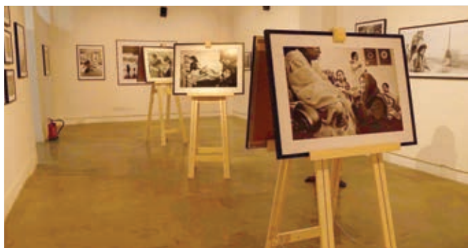
The Album, works by Shri Raghu Rai at Delhi Photo Festival