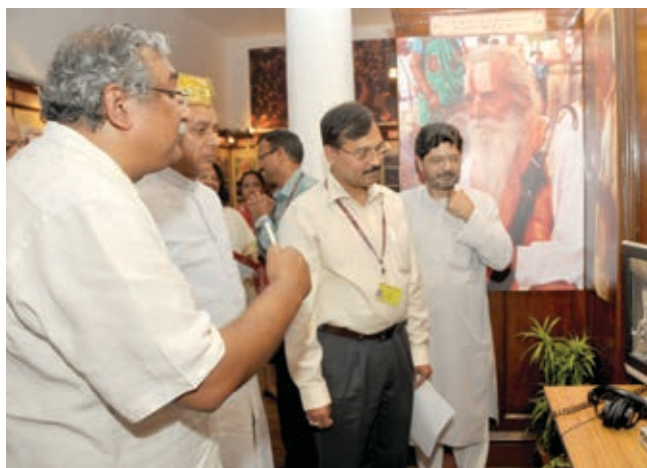
Inauguration of exhibition and Film Shri Ramlila, Ramnagar, Varanasi

Second International Conference and Festival on Ramlila , International Conference on Rock Art , Lecture series on Buddhist Studies .