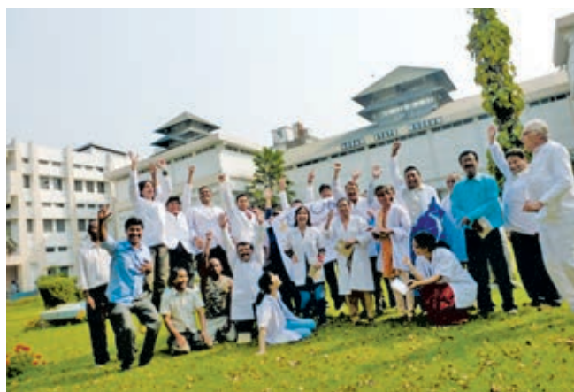
Participants during the Re-Org workshop at Guwahati