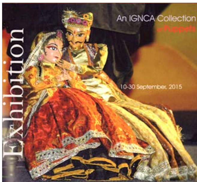
Poster of World of Puppets