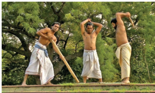
Performance during exhibition on 409 Ramkinkars

theatre artist, Ramkinkar Baij (1906-1980), which was presented through theatrical performances and visual imageries. This one-of-its-kind show opened on 6 April and closed on 6 May 2015.