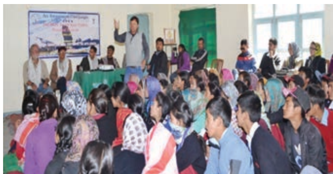
Awareness workshop at Kaza, Spiti, Himachal Pradesh

Mahal Palace Complex at Thanjavur from 7– 8 May 2015