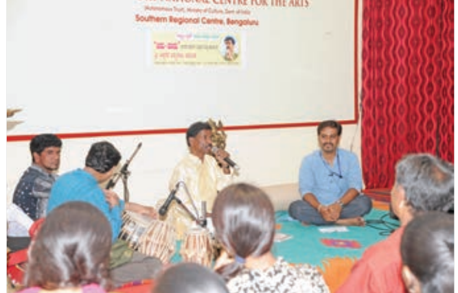
Presentation on Aadu Haadu-Folklore and Music