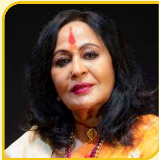
DR. SONAL MANSINGH Padma Vibhushan Awardee Former MP (Rajya Sabha)