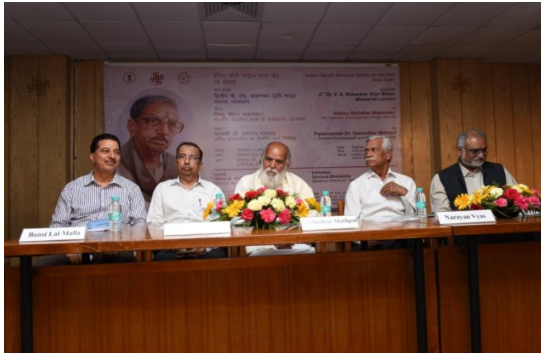
General View of Dais