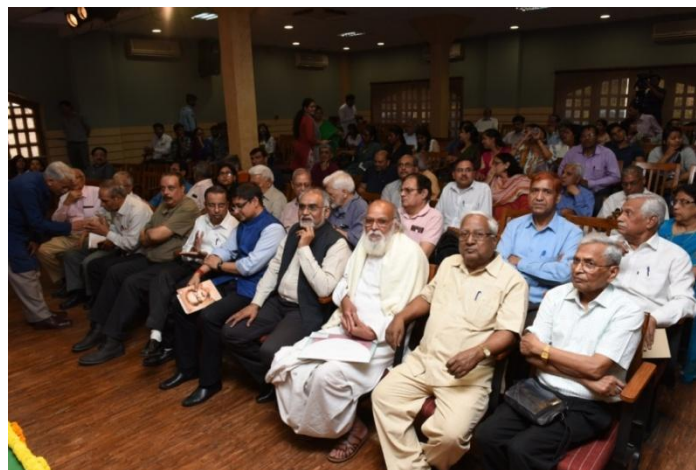
Scholars Attending the Seminar