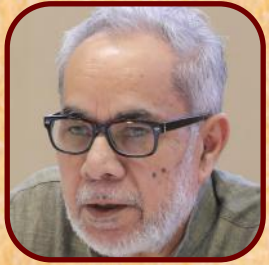
Sh. Ram Bahadur Rai President, IGNCA Trust