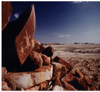
Animals petroglyphs, Pilbara Western Australia

Rock art of the world is a fascinating saga of human endeavour to translate his aesthetic sensitivity into reality. From time immemorial the early man started to record the world around him and his activities for the life sustenance and to bring forth his progenies to flourish. He lived in the natural caves and shelters which he decorated with paintings and engravings; the subject matter that he could see in nature and life around him. Rock art is known from almost all corners of the world, except Antarctica. Evidences are found from all the continents starting from the Old World i.e. Africa, Asia, Australia, Europe, North and South America. Asia is the largest continent of the world and has diverse art heritage. The huge area can be divided into five regions; Central, West, East, South and Southeast Asia. In Central Asia, the two most important rock art zones are Tamgaly of Kazakhstan and Altai.