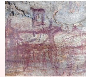
Lekhania, Uttar Pradesh

While deer and elephants are the most common animals depicted in these paintings, some exotic and imaginary animals are also seen. These shelters exhibit pictographs ranging from the Upper Palaeolithic to the Early Historical period. The paintings/ drawings mostly depict the early inhabitants' common occupations like hunting, dancing, battle scenes, and rituals. These paintings have been executed on the walls as well as ceilings of the caves and shelters as such places were considered safe by the early men. These areas are even today frequented by jackals, bears etc. and occasionally leopards according to the local people.