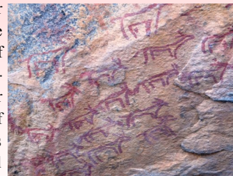
Deogarh, Sonbhadra, Uttar Pradesh

In Uttar Pradesh, the major rock art sites are concentrated in the Robjertsganj – Sonbhadra district of the region. Located between Vindhyar Range and Kaimur Range, the area had been the centre of activities of pre-historic men which is evident from the rock paintings found in abundance in this region. These rock paintings are mostly located in the rock shelters which are up to 1 meter wide and few meters long, where mostly the jointed face (which is protected from the top by a pro-