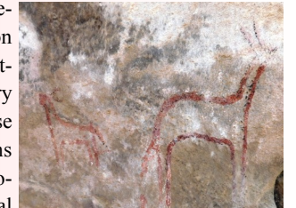
Channasva Pahar, Sonbhadra,

-truding bed of thick sandstone), or the underside of this bed. The region has a number of rock art sites, namely the well known sites of Lekhania and Panchmukhi . Other sites in the region are Murali Pahari , Harahi Pahar , Koliaghat etc. The principle subject contained in the rock art of the area is figures of humans, animals, battle-gears etc; along with various intricate and abstract patterns.