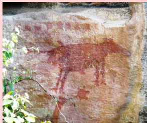
Pandavulagutta, Warangal, Andhra Pradesh

In Uttar Pradesh, the major rock art sites are concentrated in the Robjertsganj – Sonbhadra district of the region. Located between Vindhyar Range and Kaimur Range, the area had been the centre of activities of pre-historic men which is evident from the rock paintings found in abundance in this region. These rock paintings are mostly located in the rock shelters which are up to 1 meter wide and few meters long, where mostly the jointed face (which is protected from the top by a pro-