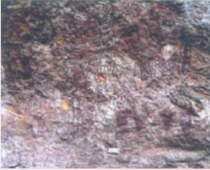
Lekhamonda, Sundergarh, Odisha

for Heritage Studies Thripunithura, Kerala (28 th November, 2014 to 28 th December, 2014), at Sangeetha Mahal Palace Complex, Thanjavur, Tamilnadu (6 th May-21 st June, 2015) and at ASI, Puratattva Bhavan, Seminari Hills, Nagpur from 19 th November to 31 st December, 2015. An exhibition on the 'Indian Rock Art' was on display in Yinchuan City, China. The exhibition was inaugurated on the occasion of the World Rock Art Conference held from the 26 th – 28 th August, 2014. The exhibition remained open for public for about one year from 26 th August, 2014 to 30 th September, 2015.