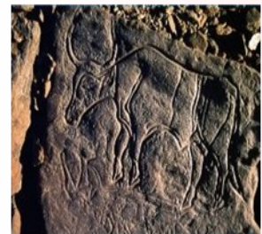
Domestic bull, Messak, Libya

Major concentrations of petroglyphs are found from the arid regions of Saudi Arabia, Nagev Desert of Israel in West Asia. In South Asia, countries like India and Pakistan are rich in rock art heritage, so much so that Bhimbetka in Madhya Pradesh (India) has been inscribed by UNESCO as a World Heritage Site. The quantity and quality of Indian rock art can vie with the art of any of the other country.