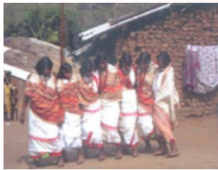
Khajuri Village, Rayagada, Odisha

For the present exhibition, exhibits are chosen from five continents of the world: Africa, Asia, Australia, Europe, North and South America. A representative collection of the significant and important traditions are displayed continent wise. This exhibition creates, for the viewer, a degree of experiential contact with prehistoric art. It provides the basis for entering into the changing aspects of the living arts of man. It is believed that man's awareness of the world around came through his primeval sense of sight and sound. These two senses have stimulated artists' expressions; visual and aural in the prehistoric past as well as in the contemporary cultures. The present exhibition also showcases the 'living art traditions' of three communities - the Lanjia-Sauras of Odisha, the Rathwa-Bhils of Gujarat and the Warlis of Maharashtra just to give a glimpse of continuity of artistic traditions in Indian context.