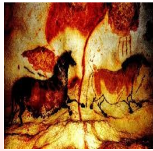
Lascaux Cave, Dordogne, France

fluting and polishing in case of petroglyphs (engravings) while in pictographs, painting and stenciling are the major techniques. The subject matter of the rock art is also varied; starting from the simplest geometrical lines found in the Panaramittee tradition of Australia to complex geometrical designs executed