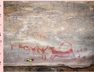
Bhimlat, Bundi, Rajasthan

After the introduction of domestication of plants and animals, the complexity of human life style in material culture as well as in social life was well evidenced in the diverse nature of depictions. The Anthropomorphic figures of the Coso range, California, the shamanistic representations of Texas, represen-