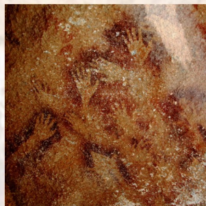
Handprints, Alashan, Yabulay, Inner Mongolia

Rock art is known from almost all corners of the world, except Antarctica. Evidences are found from all the continents starting from the Old World i.e. Africa, Asia, Australia, Europe, North and South America. Asia is the largest continent of the world and has diverse art heritage. Both India and China are fortunate in