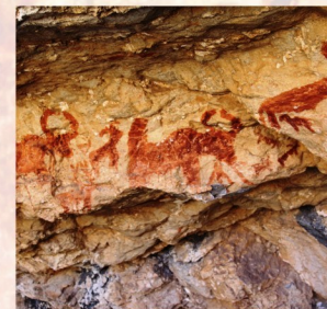
Yaks, Ritu, Western Tibet