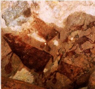
Animal figures, Kaimur hills, Bihar

patterns. Central and Western zones have painted rock shelters where specific themes are drawn. In the Eastern zone rock paintings show large number of decorative motifs. Petroglyphs (engravings on rock) are a novel feature of Odisha. Petroglyphs depicting hunting scenes, procession of animals and dancing human figures are the main themes in the rock art of Jammu and Kashmir. In Uttarakhand, paintings of rows of anthropomorphic figures are the common motif. South India has both pictographs as well as petroglyphs. Petroglyphs, most popular in Karnataka, depict figures of humped cattle, deer and hunting scenes on boulders. The present exhibition also showcases the 'living art traditions' of three communities; the Lanjia-Sauras of Odisha, the Rathwa-Bhils of Gujarat and the Warlis of Maharashtra just to give a glimpse of continuity of artistic traditions in Indian context.