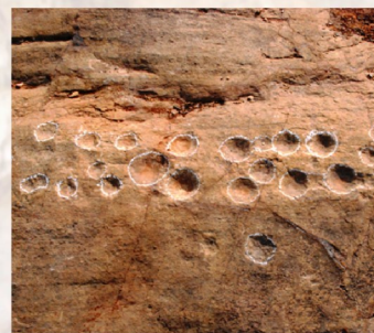
Cupules, Juci Moutain, Henan Province

In the rock art of China there is a close relationship between the distribution of Chinese rock art and ancient Chinese tradition, ecology and environment, economic models and ethnic cultural circles. In the rock art of the northern grasslands, animal gods and reproductive ceremonies were made by nomadic groups, while on the Qinghai-Tibet plateau, changes in the indigenous Bon religion can be traced through changes in rock art, which also reflects movements of people. South-western China is an area of pictographs, and the large painted sites in this environment of closed mountains and valleys indicate that people focused on the strong function of the social organization.