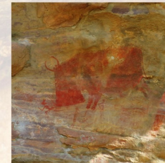
Boar and human figures, Bhimbetka, Madhya Pradesh

Collective tribal dance in this region was used to communicate worship to tribal ancestors. In the old rock art of eastern China are the simple abstracts, including many recesses or cupules.