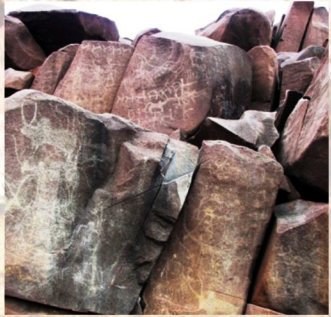
Animal petroglyphs, Kupgal, Bellary

patterns. Central and Western zones have painted rock shelters where specific themes are drawn. In the Eastern zone rock paintings show large number of decorative motifs. Petroglyphs (engravings on rock) are a novel feature of Odisha. Petroglyphs depicting hunting scenes, procession of animals and dancing human figures are the main themes in the rock art of Jammu and Kashmir. In Uttarakhand, paintings of rows of anthropomorphic figures are the common motif. South India has both pictographs as well as petroglyphs. Petroglyphs, most popular in Karnataka, depict figures of humped cattle, deer and hunting scenes on boulders. The present exhibition also showcases the 'living art traditions' of three communities; the Lanjia-Sauras of Odisha, the Rathwa-Bhils of Gujarat and the Warlis of Maharashtra just to give a glimpse of continuity of artistic traditions in Indian context.