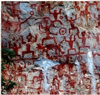
Rock painting of Huashan, Zuojiang River, Guangxi

E arly man started to record the world around him and his activities for the life sustenance and to bring forth his progenies to flourish since time immemorial. He inhabited the natural caves and shelters which he decorated with paintings and engravings; the subject matter that he could see in nature and life around him. Naturalistic representations of wild animals and hunting scenes are thus the most common subjects.