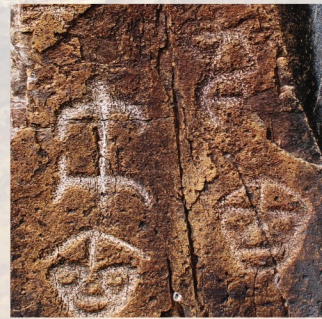
Anthropomorphs and human face, Xianzitan, Fujian

possessing one of the largest concentrations of this precious heritage. The rock art repertoire of China is rich and diverse. Chinese rock art, whether realistic or abstract, zoomorphic or simple cupules, can be connected to early human traditions and spirituality. Researchers believe that cupules, abstracts and simple mask images are the earliest rock art in China. Scenes with animals or humans increased in the rock art and also in the spiritual life of people during the Bronze Age. Due to its long tradition of written history in China, it is possible to make spiritual connection further back in time with more confidence than for many other parts of the world.