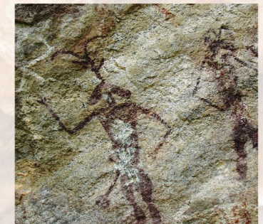
Human figures, Ongana Beni Pahar, Raigarh, Chhattisgarh

For the present exhibition, exhibits in the Indian section are chosen from the following five regions of India: i) Rock Art of Northern Region, ii) Rock Art of North-East Region, iii) Rock Art of Southern Region, iv) Rock Art of Eastern Region, v) Rock Art of Western Region and vi) Rock Art of Central Region.