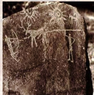
Hunting scene and sun motifs, Burzahom, Jammu and Kashmir

Domestication of plants and animals, the complexity of human life style in material culture as well as in social life was well evidenced in the diverse nature of depictions. This prehistoric art perhaps comes to signify the underlying philosophies and the worldview of our ancestors, and tells us about the soul of a community, its thoughts, beliefs and emotions. In this great diversity of the rock art heritage, instances of the universality of human mind is also mirrored in the depictions of Cupules and Hand prints found almost in all the corners of the world.