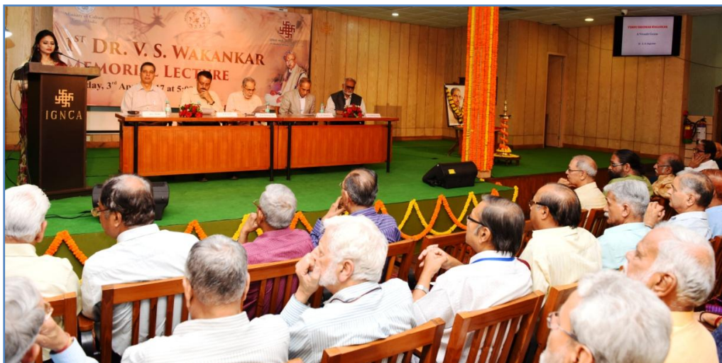
A view of the audience at the event.